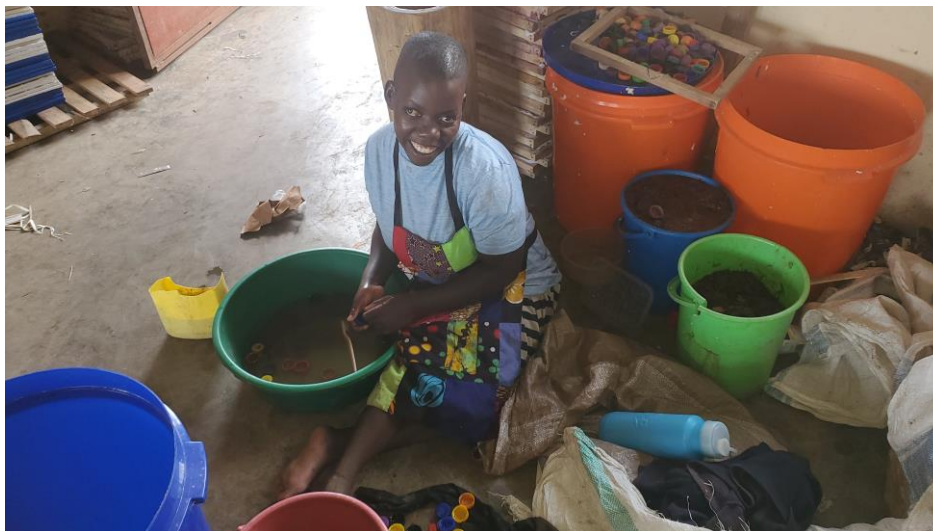
WASHING PLASTIC BOTTLE_TOPS FOR LATER RECYCLING AND PRODUCING OTHER NEW PLASTIC ITEMS.