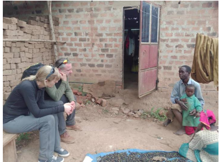
DONORS VISITING CHILDREN AT THEIR HOME