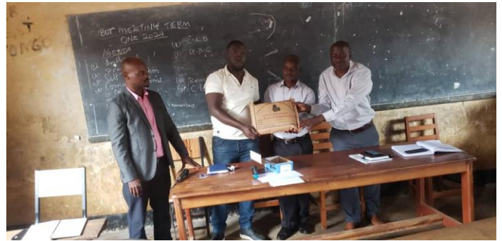
GIVING OUT BOT EXAMS