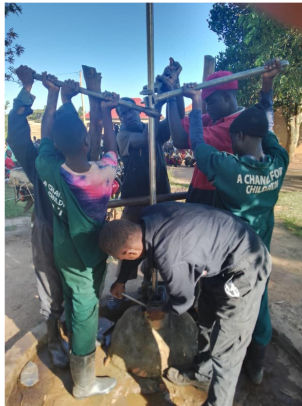
WATER TEAM REHABILITATING BOREHOLE

The water program drills and rehabilitates boreholes in rural areas. Since the program started 74 boreholes have been drilled in different sub counties which help communities to get clean water and reduce absenteeism of learners due to carrying water long distances. All boreholes are drilled on community land and each community has to form a water committee which is responsible for care of the boreholes, reporting to our team when there are problems.