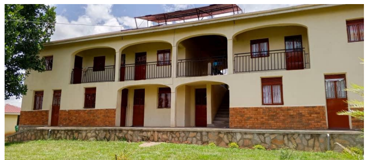
VIEW TO NAKAZIBA AND KALANGALO BUILDINGS