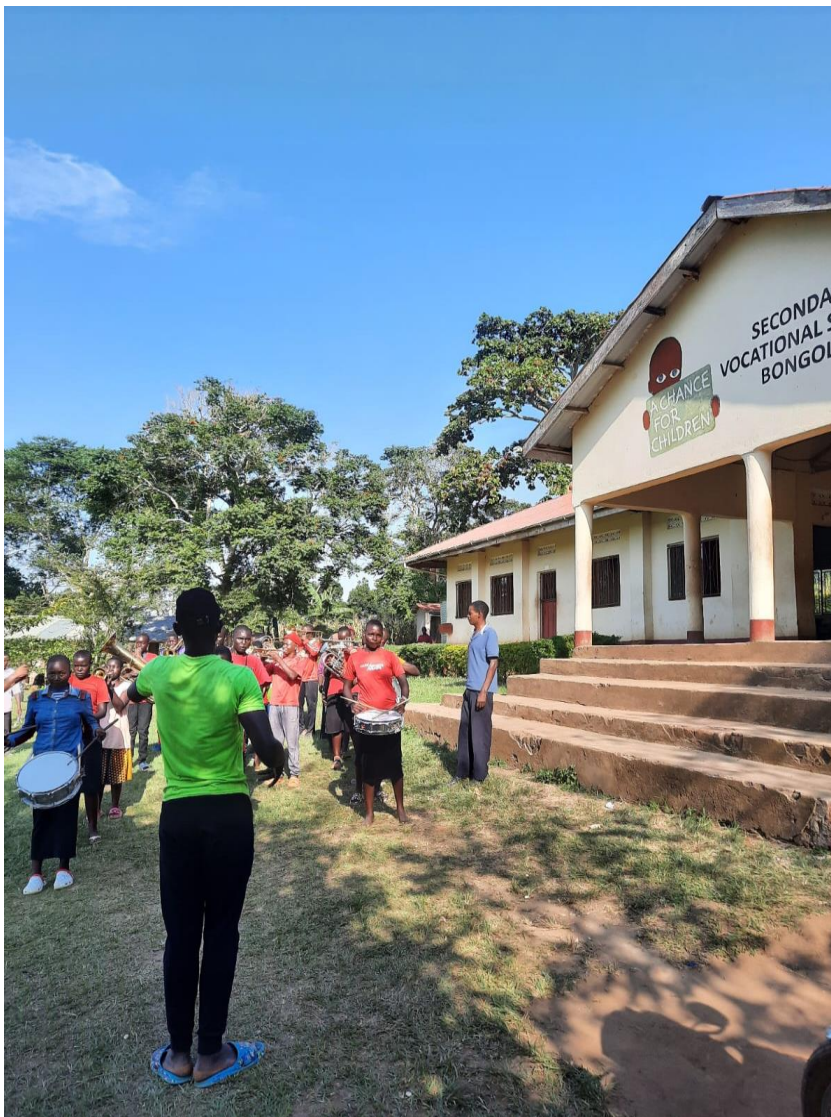
STUDENTS IN BRASSBAND IN BONGOLE SECONDARY