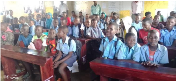
DESKS GIVEN BY ACFC

Mityana district 56 schools Mubende district 20 schools