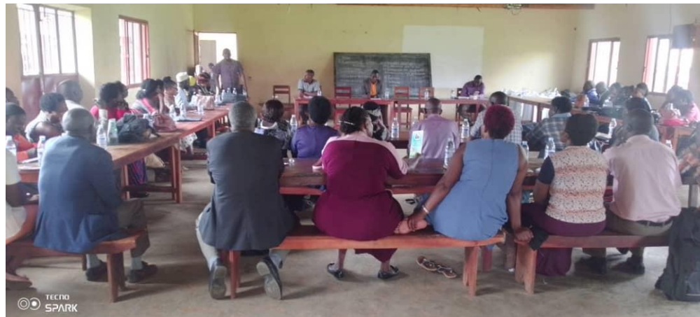
MEETING HEADTEACHERS OF GOVERNMENT SCHOOLS