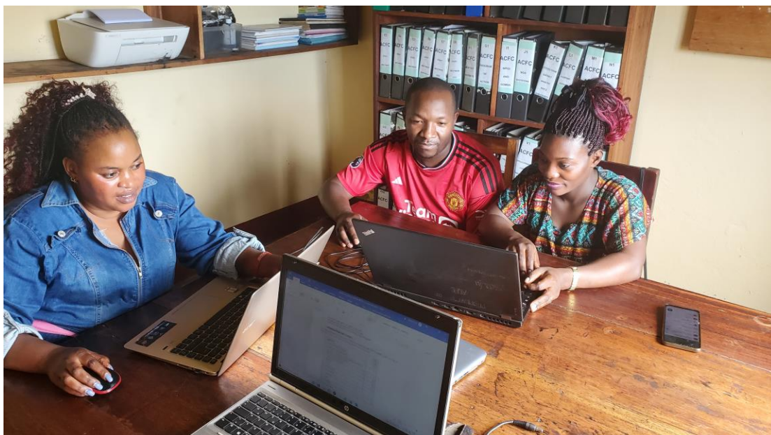
SECRETARIES AND ACCOUNTANT OF THE HEADQUARTER ZIGOTI