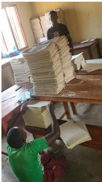
STUDENTS PRODUCING SCHOOL BOOKS FOR OUR SCHOOLS AND FOR SELLING.