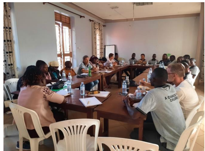
MEETING WITH AUSTRAN BOARD