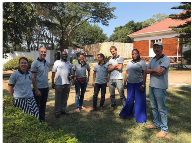
AUSTRIAN AND UGANDA MANAGEMENT