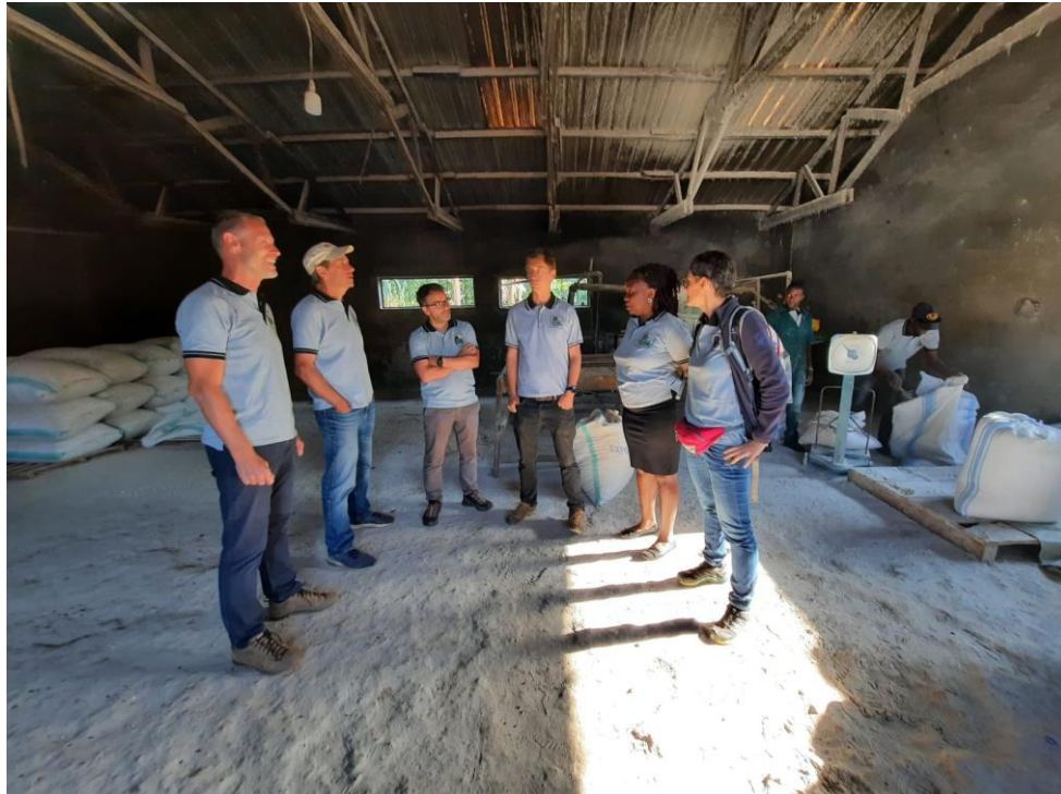
DEVELOPEMENT PARTNERS WITH THE COORDINATOR