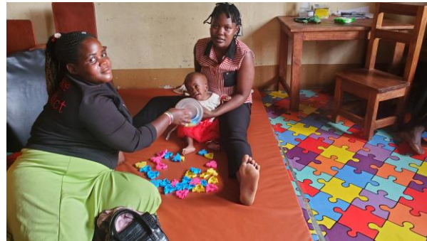
SPECIAL NEEDS CHILDREN IN CLASS AND THERAPY