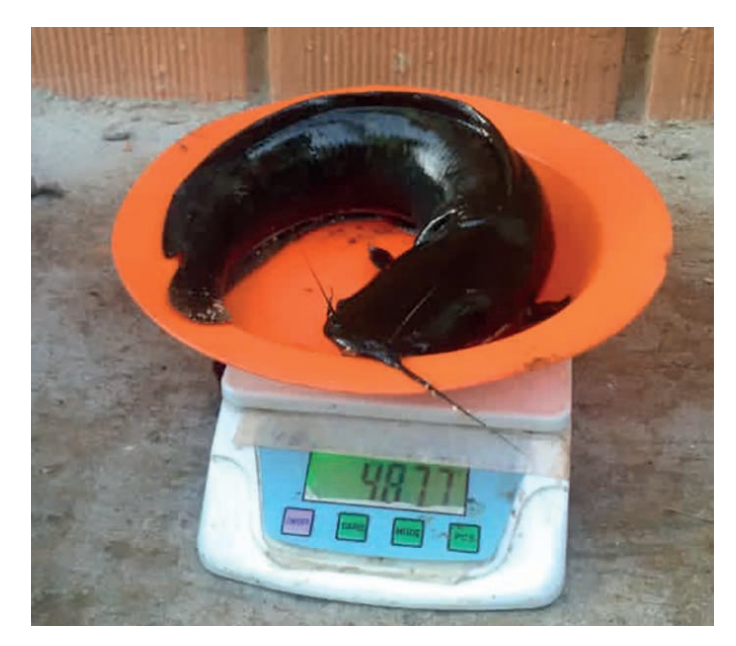
After five months the fingerling became a big fish ready to eat