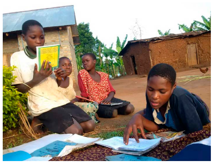
Children stuyding from home during lockdown