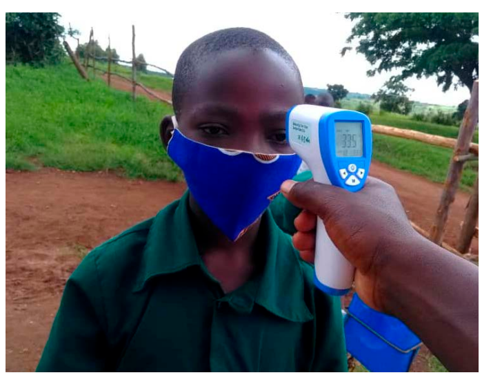
SOPs taken at Butimba for candidates