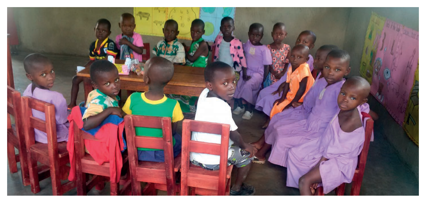
Middle class in Kamusenene nursery school