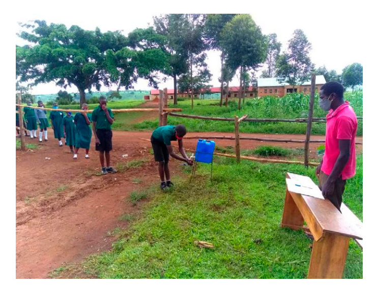
SOPs were strictly followed at ACFC schools