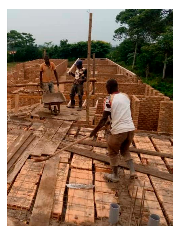
Building site Nkozi