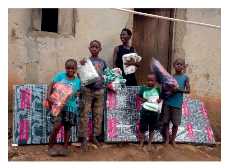
Distribution of beddings to families who had to sleep on the ground