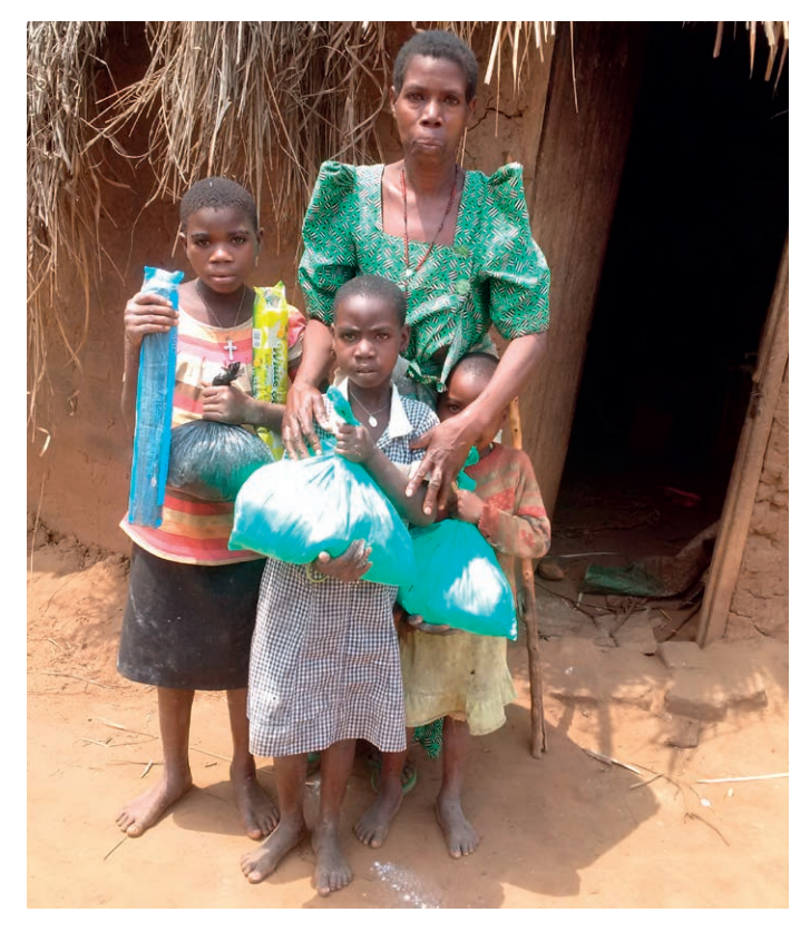
Food support in lockdown