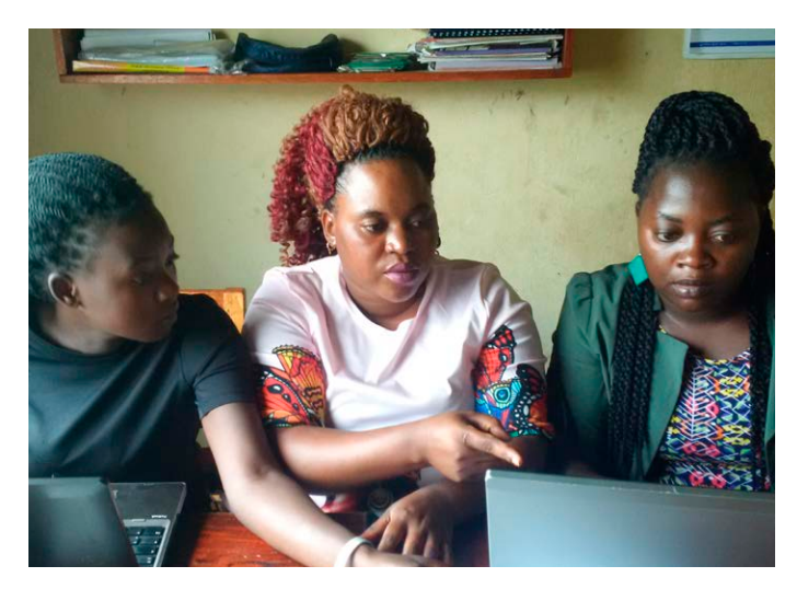
Administration staff of headquarter and CB schools