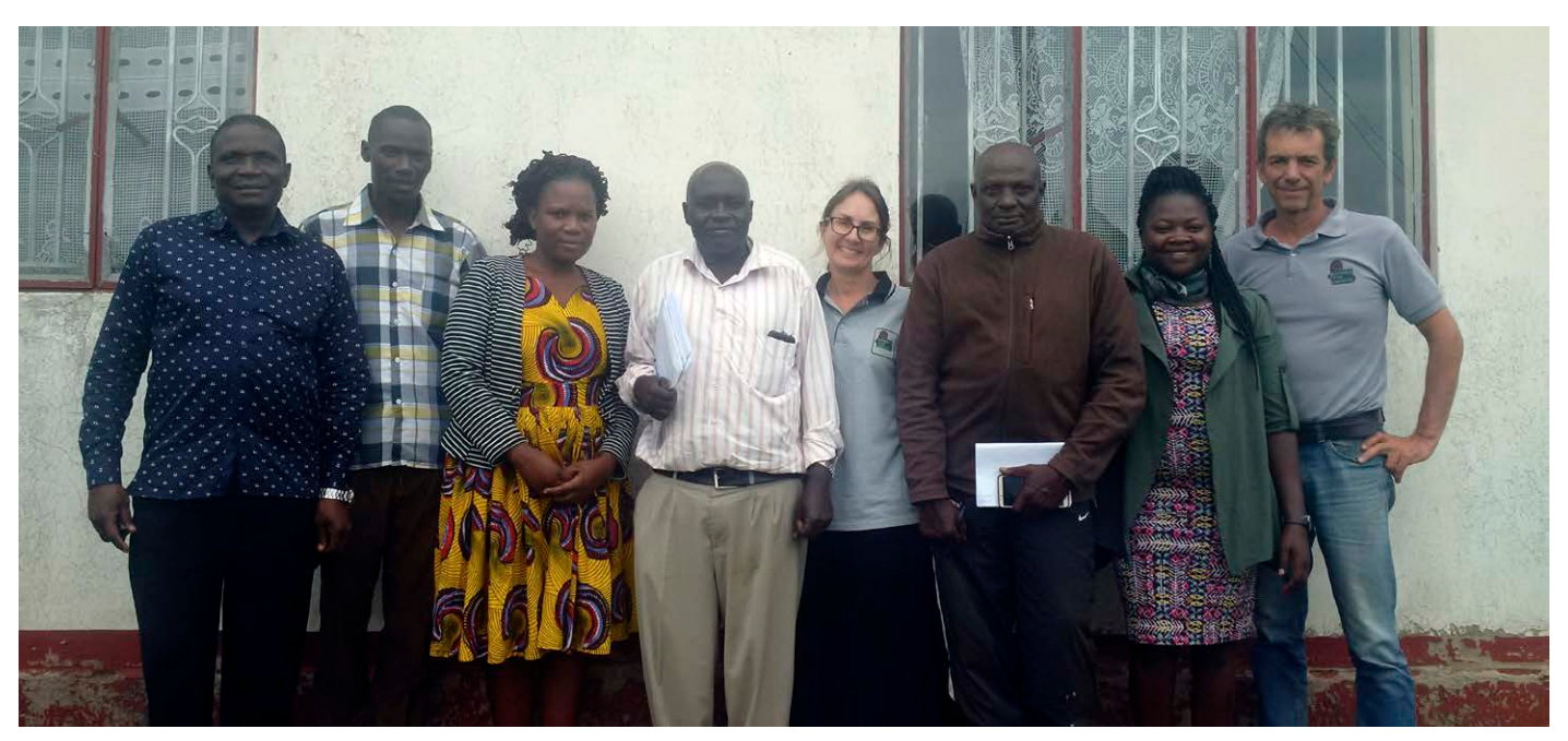
ACFC general assembly 2020