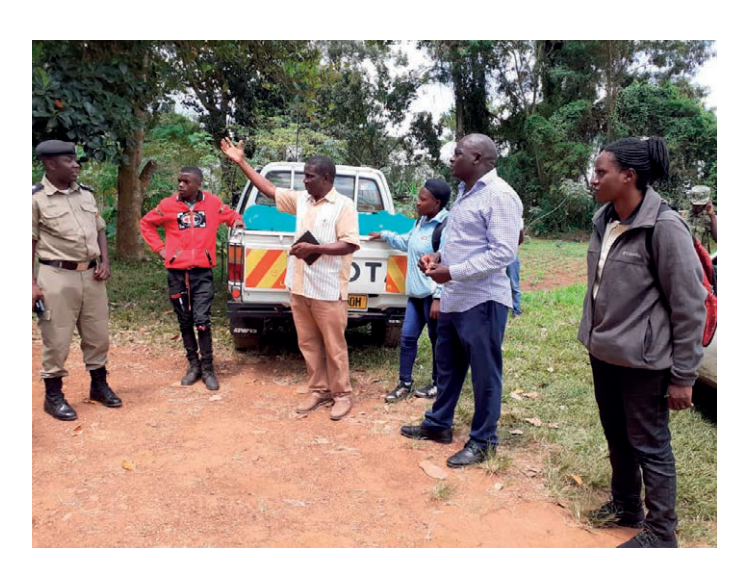
ACFC management team meeting district officials in MItyana to organise food distribution during lockdown