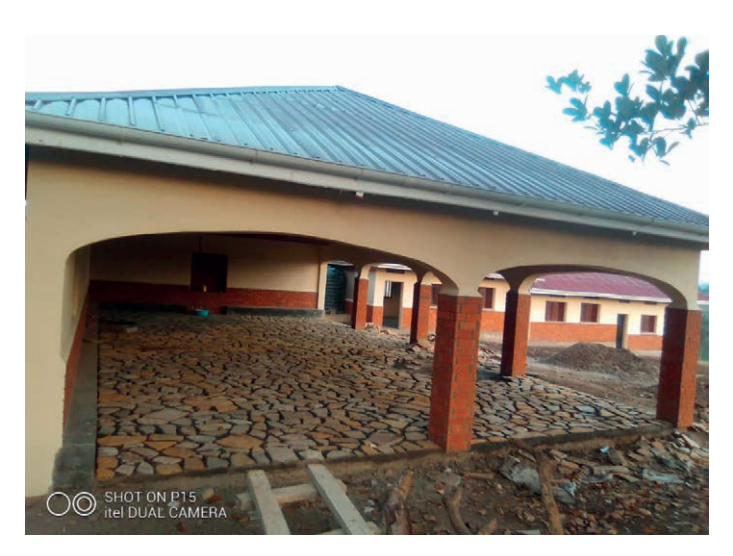
The veranda of the Gruenerbl school in Kamusenene is nearly done