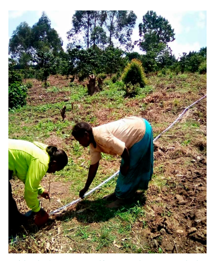
Social worker from Nateete teaching a parent how to measure land for planting