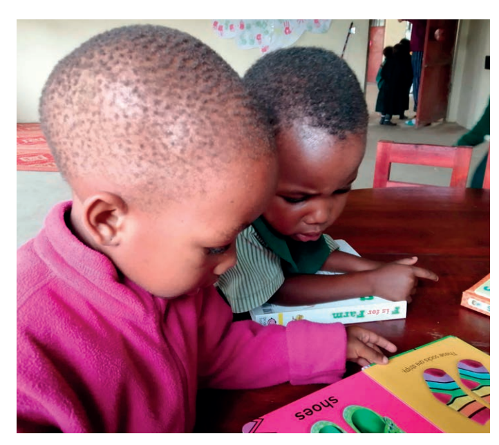
Children at Nakaziba nursery school

A fish and larvae project started off well and was conducted throughout 2020 with reasonable success. Furthermore, the drip irrigation and a wider irrigation system for a big part of the farming land was established.