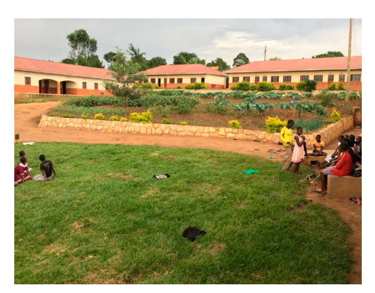
Primary school Kakindu

In the list above nursery and primary schools are only separated where they already have separate administrations. Most of our schools are registered with ministry of Education and Sports and few of them have not yet received their certificates but already submitted documents to the responsible offices. The primary schools in Bongole, Kakindu, Nateete and Lubajja have facilities for boarders. This year however we had to concentrate on homeschooling, so our teachers went so see the children in the villages and met them in small groups to teach them and give them and collect homework. Families of our supported children lack access to internet, television, radio or newspapers.