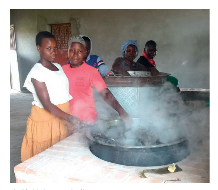
The big kitchen at Nakaziba