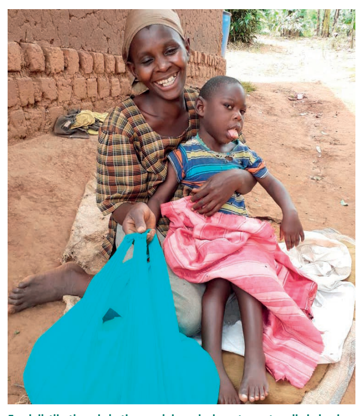
Food distibution als in the special needs departement really helped the mos needy ones.