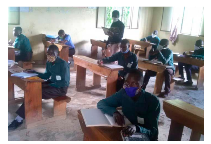
S4 candidates back at school

Both Schools have registered Centers for UCE (O level) exams with facilities for boarders. Both schools offer vocational subjects and the best students can do the DIT exams at the end of Senior 3.