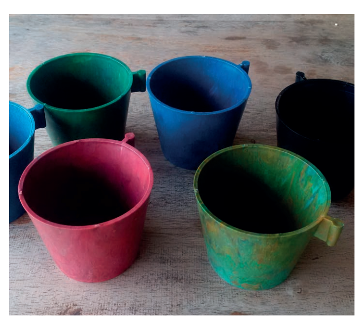
Plastic cups made out of old plastic