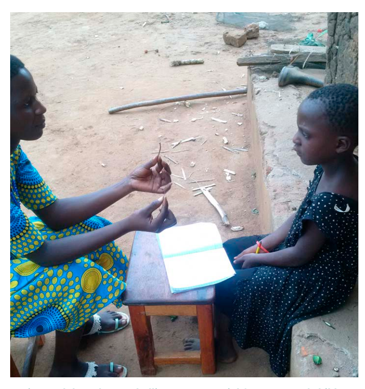
During Lockdown homescholling was essential for supported children