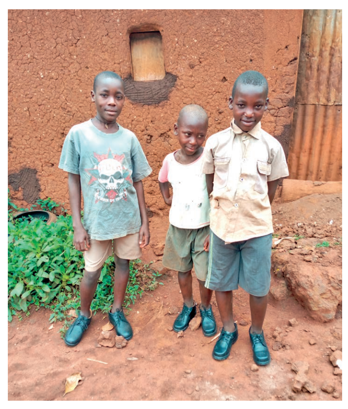
Shoes were given to more than 200 children.