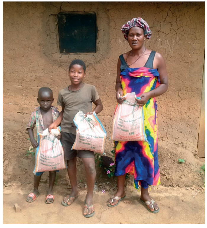
228 families benefited from the seeds programme