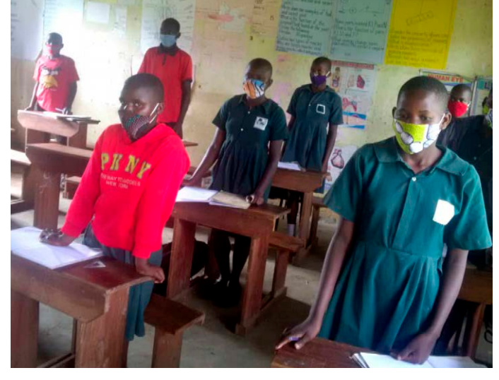
Senior 4 candidates back at school in Nateete