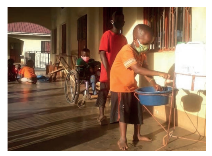
Special needs children back at CB school in Zigoti

Both our nurses in Busunju and Mubende division started visiting children who were sick in the field and offered them treatment services.