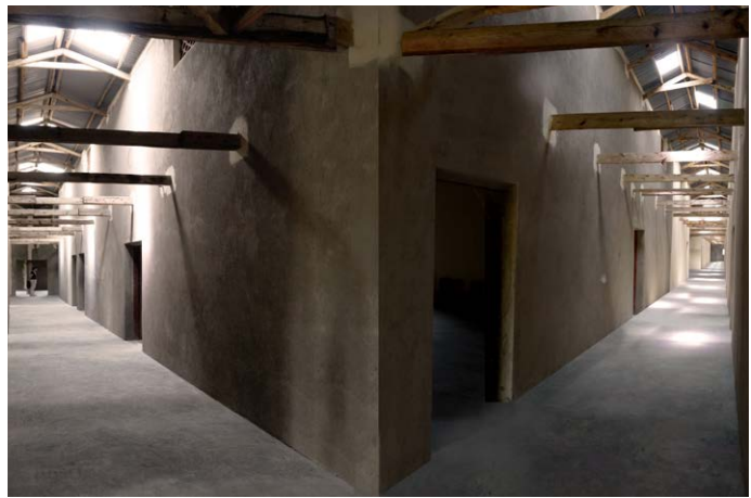
Inside school for all Busunju