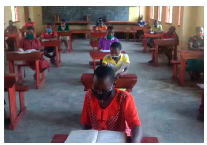
Senior 4 candidates back at school in Bongole