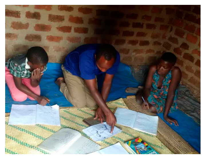
Homeschooling in Nateete