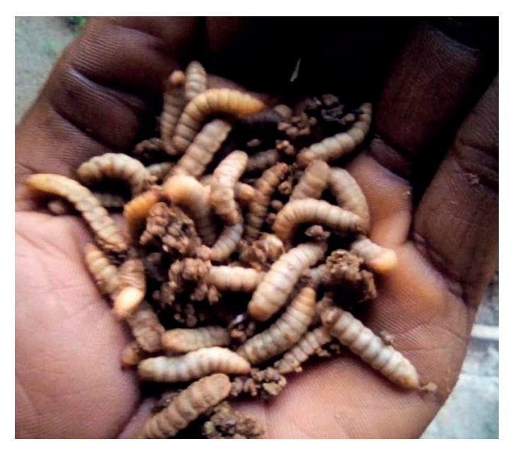
Larvae fed from bio waste serves as chicken and fish feeds