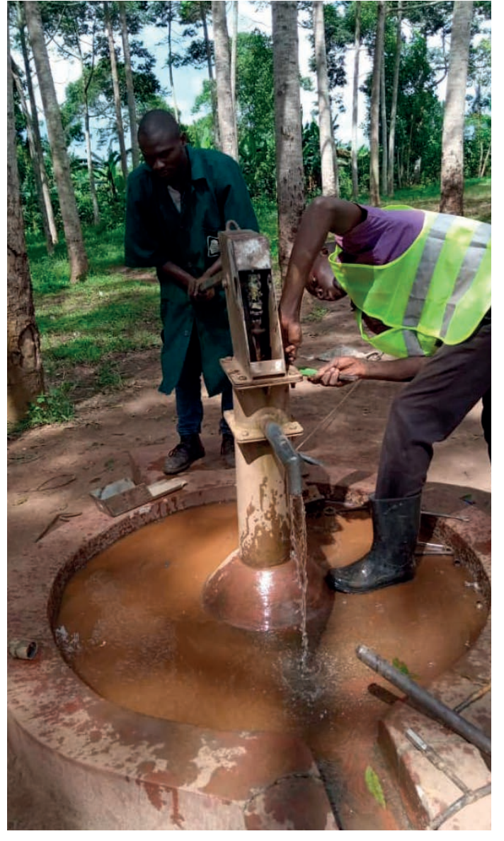
ACFC water team at work