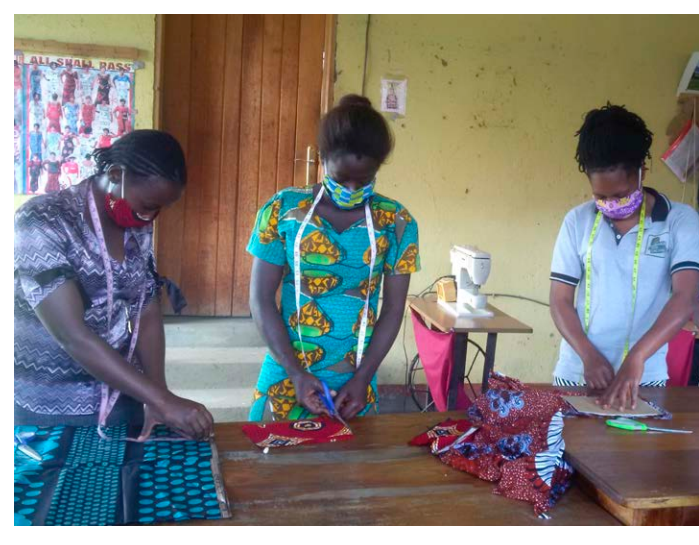
In taloring masks were made and then distributetd to staff and students