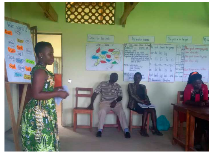
Workshop at Nakaziba nursery teachers college