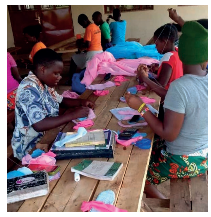
Sanitary pad workshop