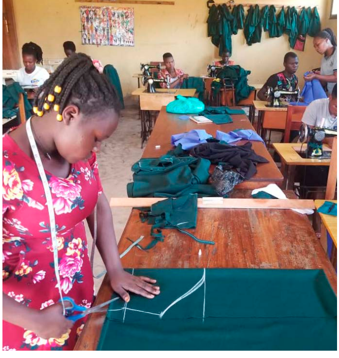
Practical skills are essential for the future of the students