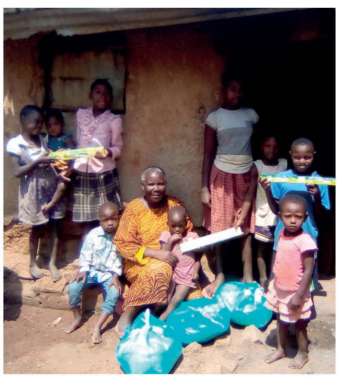
Food distribution to a very needy family