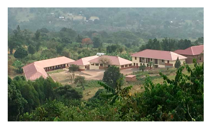
Primary School Kalangalo

ACFC runs several of its own schools. The first were Bongole Primary and Butimba Primary schools which opened in 2010. The last to open was Kamusenene nursery and primary plus nursery section for school for all Busunju.