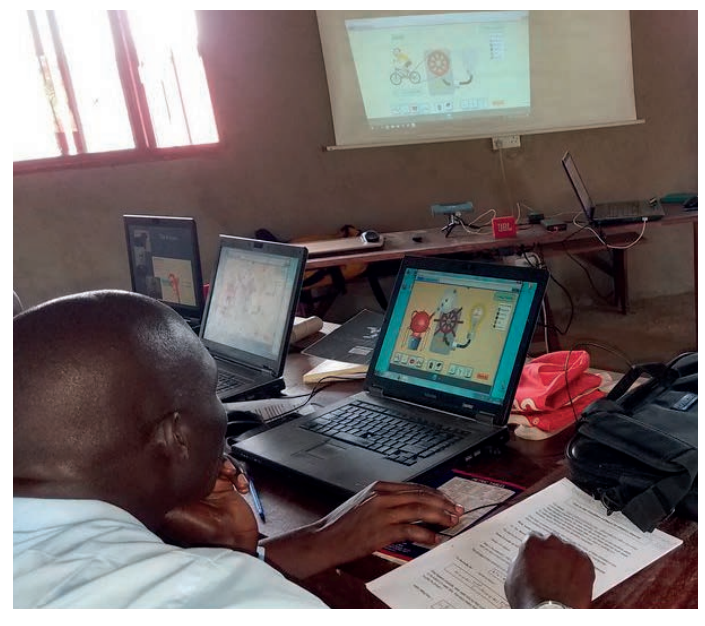
Computer and physics workshop in Nakaziba