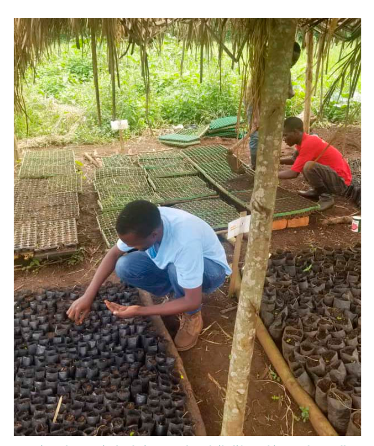
Farming plays a vital role in Uganda's daily life and is taught at all ACFC stations