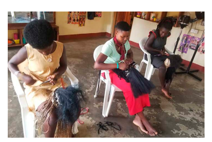
ACFC hairdressing workshop in Zigoti