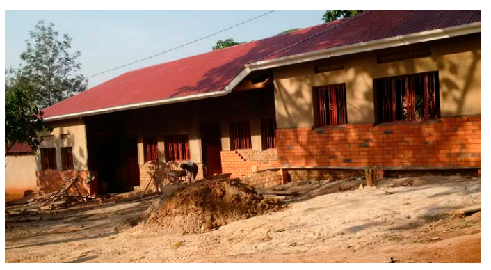
Buidling site Ttanda