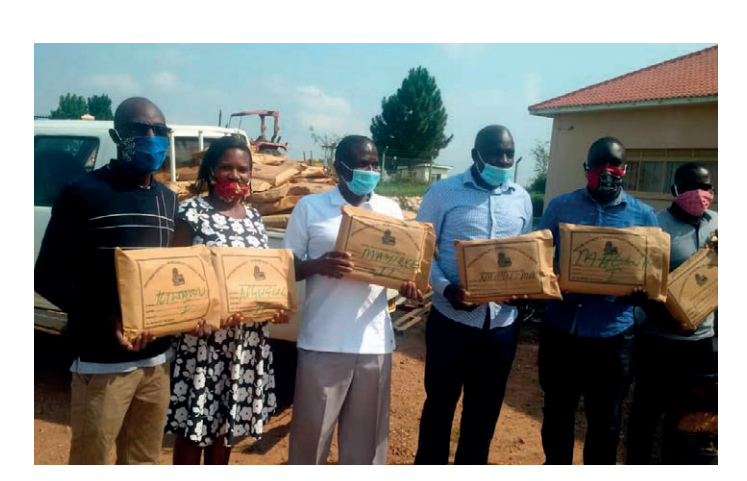
Distribution of learning packages by ACFC in Mityana