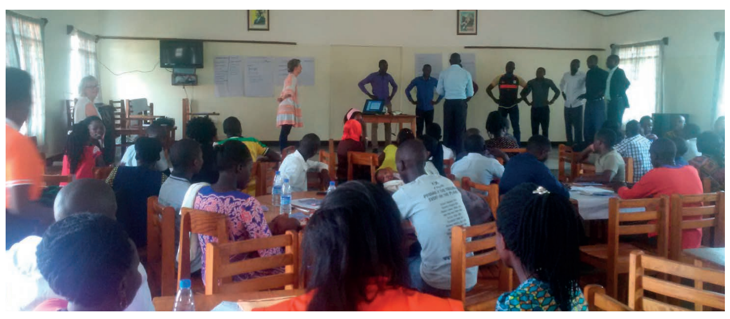
Teachers workshop in January