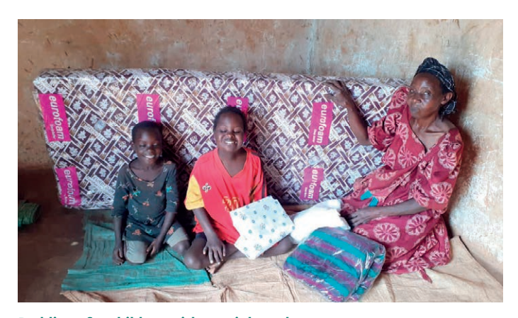
Beddings for children with special needs