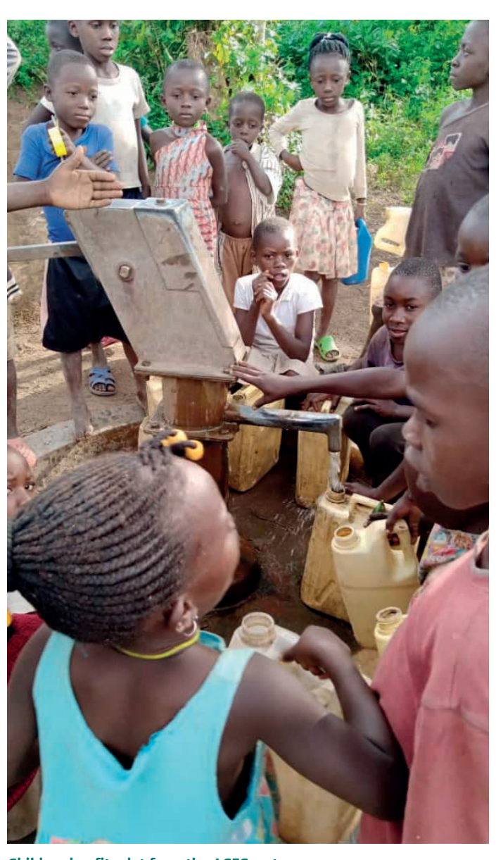
Children benfit a lot from the ACFC water programme

A CHANCE FOR CHILDREN drilled 2 boreholes in 2020. Since the programme started 65 boreholes have been drilled in different sub counties which help communities to get clean water and reduce absenteeism of learners due to carrying water long distances. All boreholes are drilled on community land and each community has to form a water committee which is responsible for care of the boreholes, reporting to our team when there are problems. Due to the lockdown drilling new borehols was stuck as movements were very restricted. However, the water team of ACFC managed to rehabilitate 163 in 2020 making a total of 245 rehabilited boreholes in Mityana, Mubende and Kasanda districts.