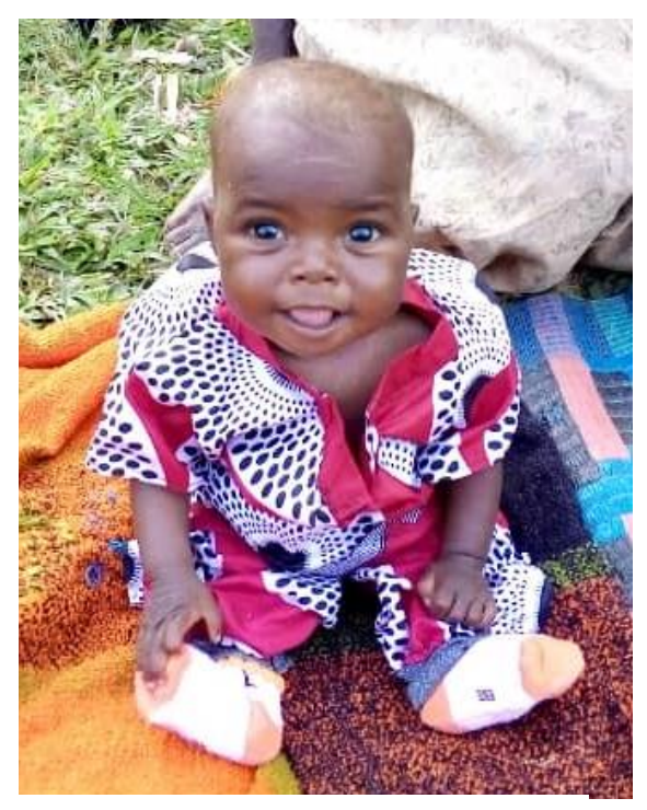
Child improved in nutrition