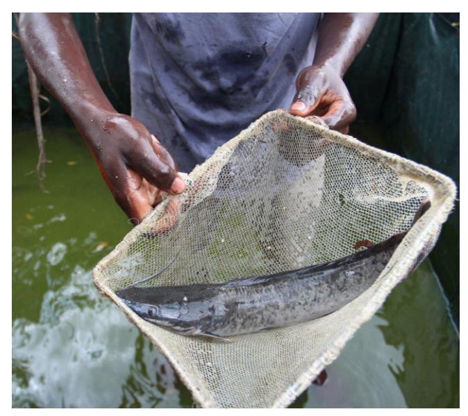
Catching fish from the pool in Nakaziba