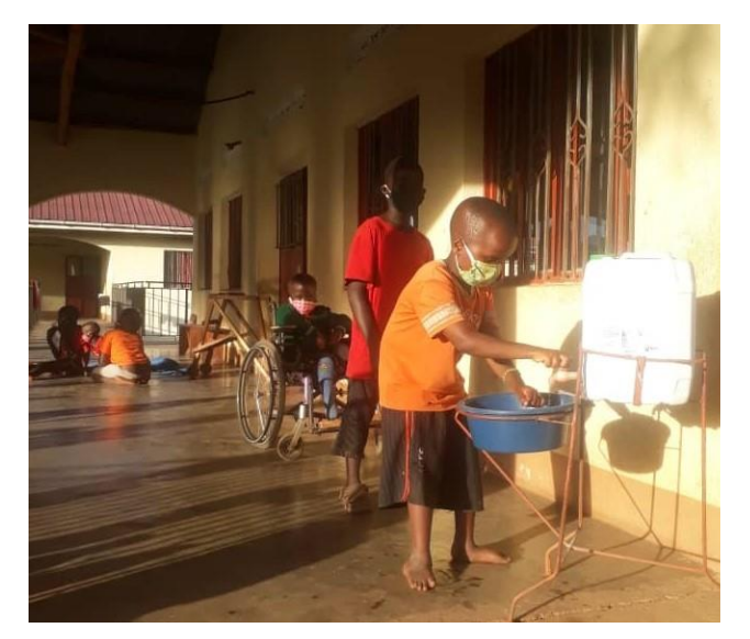
Hand washing in special needs school