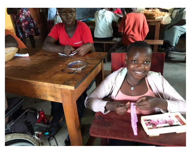
Making re-usable pads with children