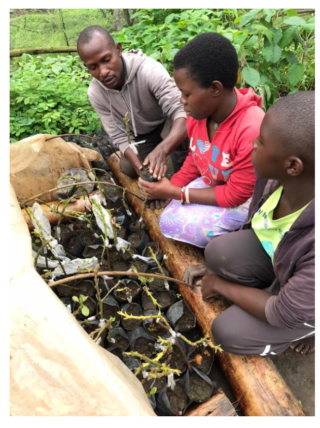
Farming plays a vital role in Uganda's daily life and is taught at all ACFC stations