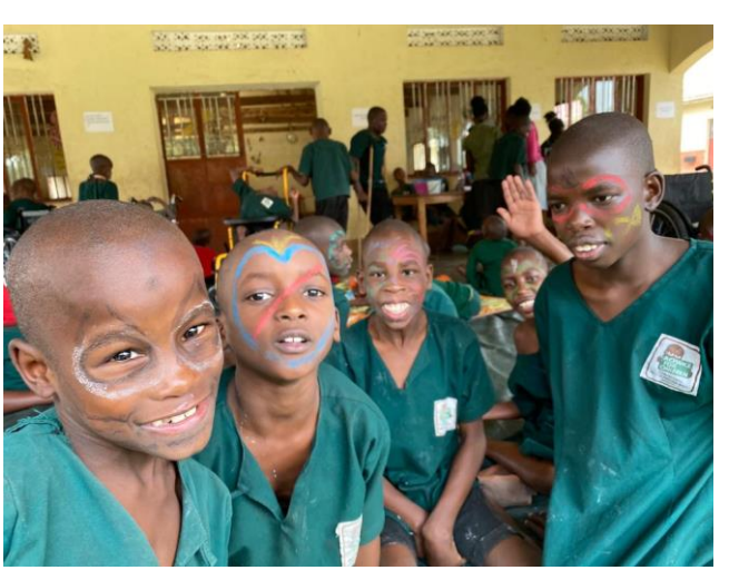
Art and Craft in Christoph Bettermann School 2 (CB2)