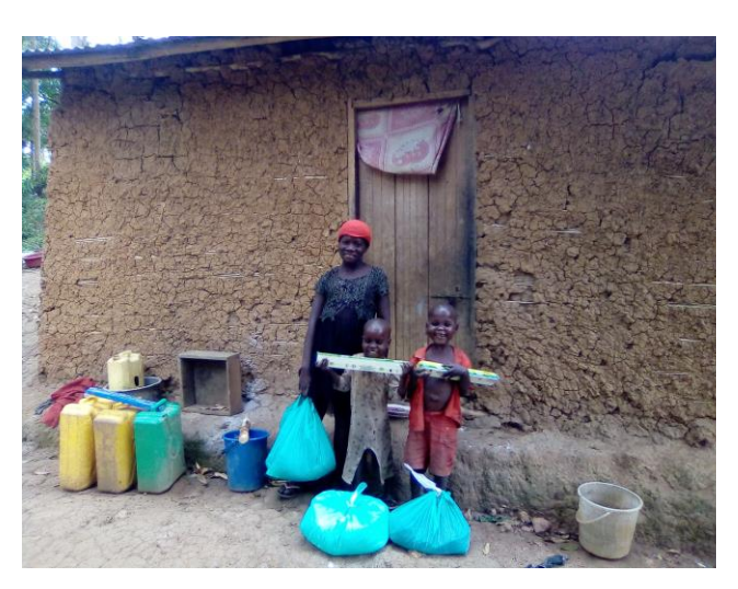
Food and Soap Supply in the villages