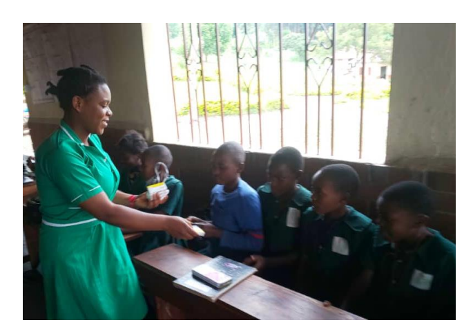
Deworming with a nurse in the station