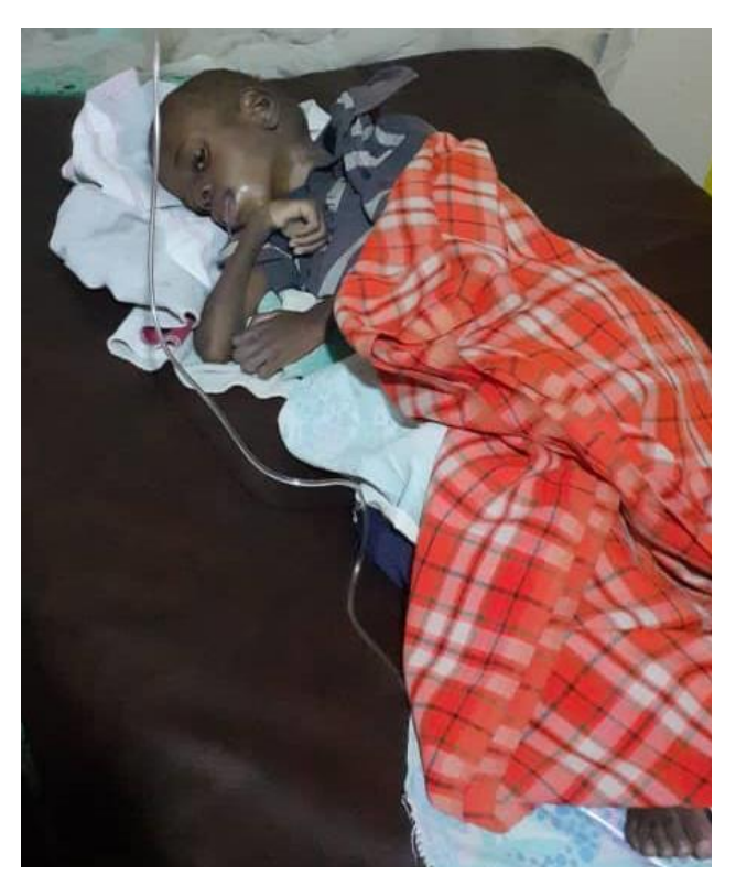
Providing health services to needy families