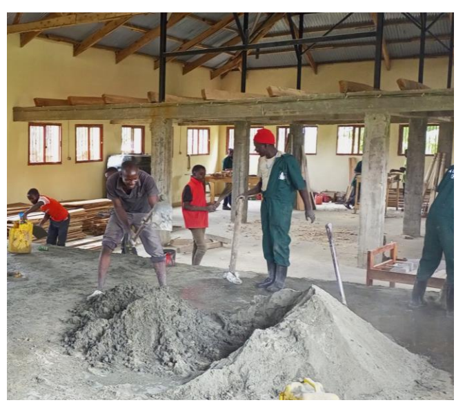
Building students working on the floor for the Workshop building