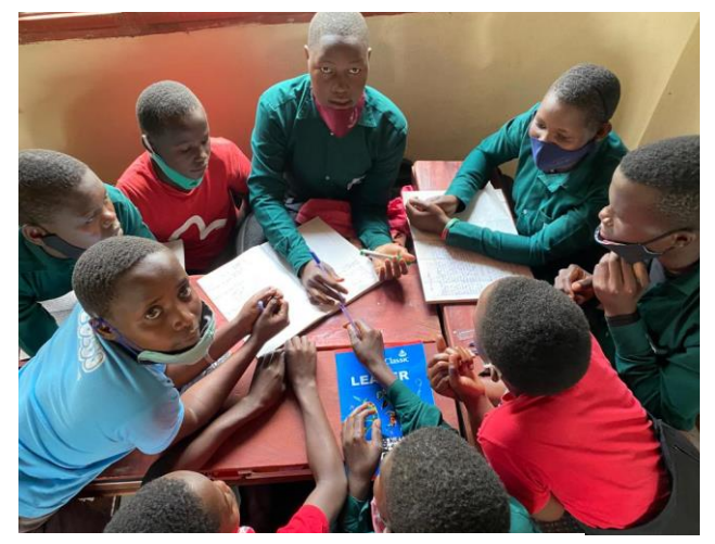
Students at one of ACFC`s Secondary schools preparing for the new year