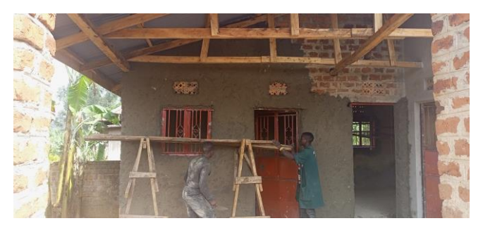
Builder Godfrey and one student working on the plastering