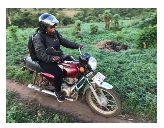
Both female and male Social Workers are going in the field with the motorbike