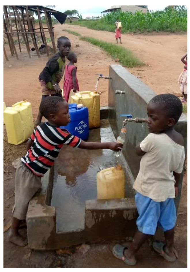
Water given out from the community taps

A CHANCE FOR CHILDREN drilled one borehole in 2021. Since the programme started 66 boreholes have been drilled in different sub counties. They help communities to get clean water and reduce absenteeism of learners due to carrying water long distances. All boreholes are drilled on community land and each community has to form a water committee which is responsible for care of the boreholes, reporting to our team when there are problems. The water team of ACFC managed to rehabilitate 163 in 2021 making a total of 322 rehabilited boreholes in Mityana, Mubende and Kasanda districts. We also motorized five in the year 2021 of a total of ten since we started.