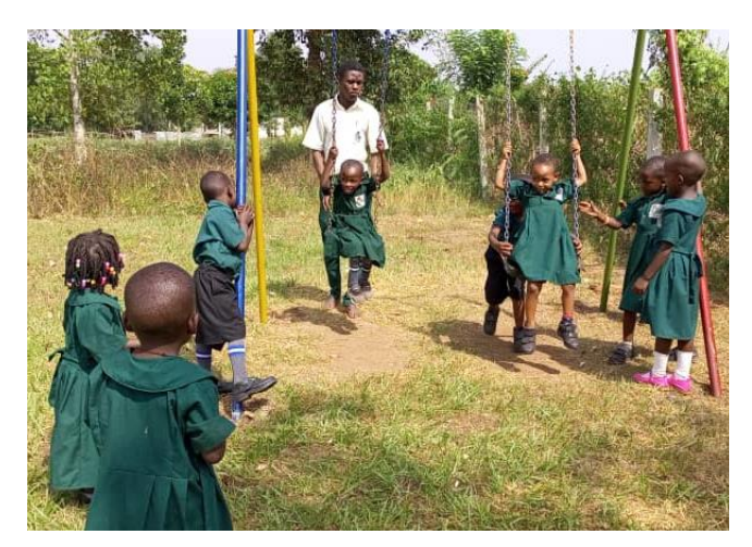
Nursery teachers' college student during his school practice

A fish and larvae project started off well and was conducted throughout 2021 with reasonable success. Furthermore, the drip irrigation and a wider irrigation system for a big part of the farming land was established. Staff stationed at Nakaziba includes several farmers, teaching staff of the college and the nursery school, a matron for students on ground, a cook and a manager for the entire area.