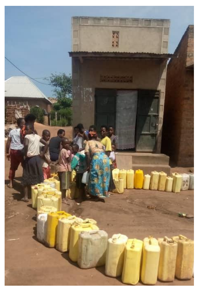
High demand of clean water in rural areas