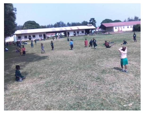
Nursery School in Nateete