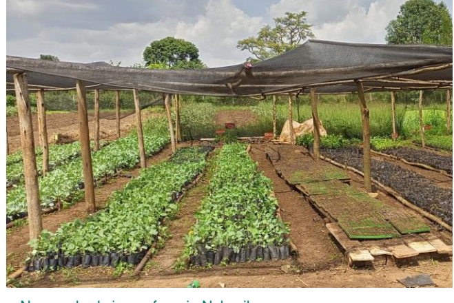
Nursery beds in our farm in Nakaziba