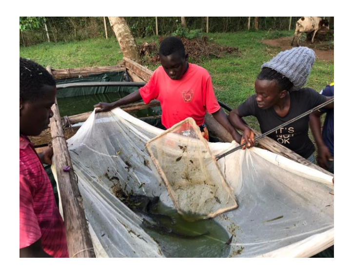
Students catching fish in our hatchery in Nakaziba