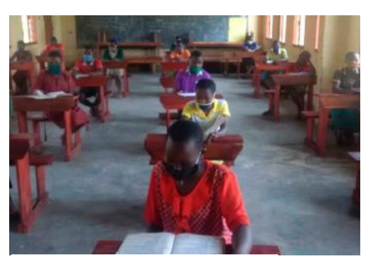
Senior 4 candidates back at school in Bongole