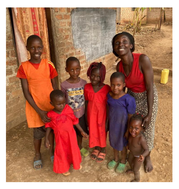
HIV positive living children at their home in old project

Our social workers carry out regular visits to their homes to check on hygiene, bedding, hospital attendance and health status. In case of severe sickness, if they are admitted to hospital, we cover treatment costs. Three times a year during school holidays, we offer special counselling meetings with nurses and counselors.