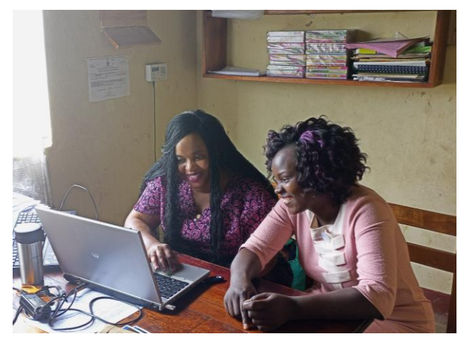
Secretary and Accountant of the Headquarter