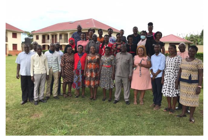
Management with Headmasters and Headmistresses of our stations