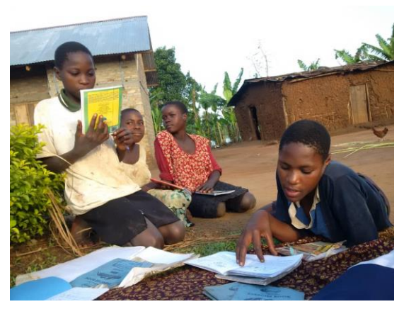
Children studying from home during lockdown