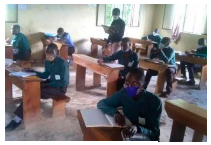
S4 candidates back at school in Nateete

Both Schools have registered Centers for UCE (O level) exams with facilities for boarders. Both schools offer vocational subjects and the best students can do the DIT exams at the end of Senior S3.