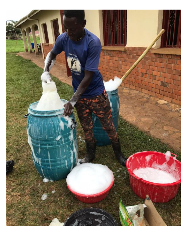
Producing Liquid Soap with the students in Nakaziba for all our stations