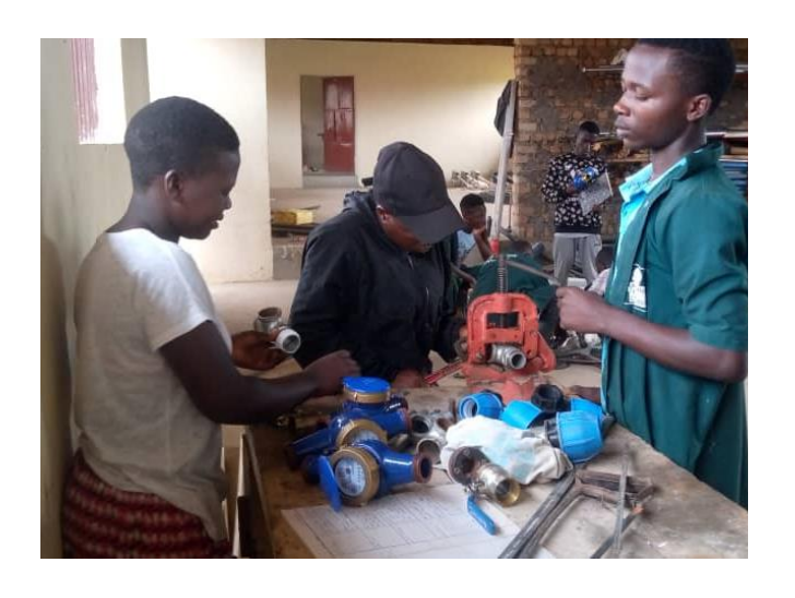
Borehole & Plumbing students learning how to connect pipes

The vocational training program started off well in 2020 with courses on solar energy, basics of electricity, plastic recycling, cooking and most of all modern farming.