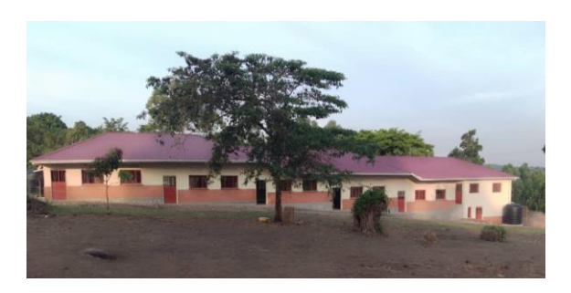
New opened Secondary School in Kalangaalo