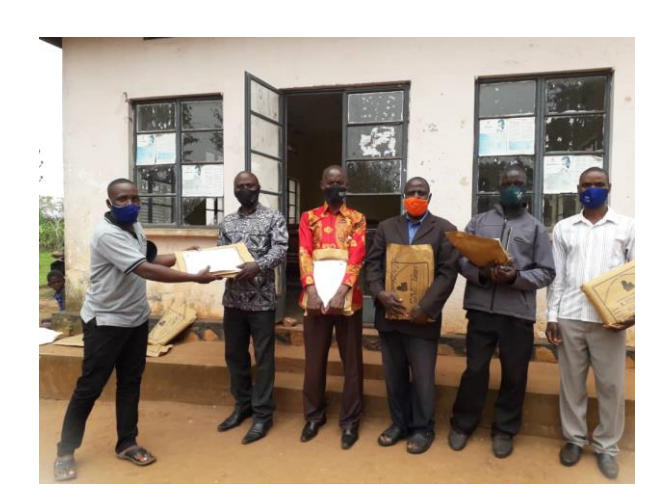
Distribution of learning packages by ACFC in Mityana