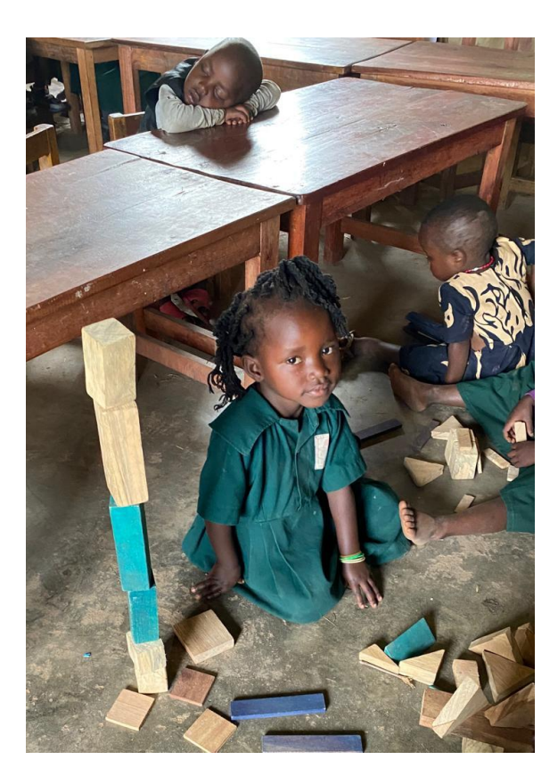
Baby Class in Kamusenene Nursery