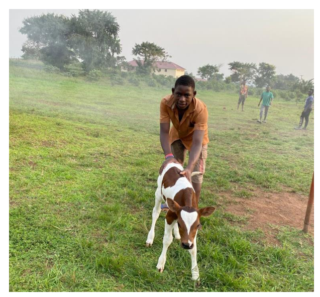
Students in Nakaziba learning animal husbandry