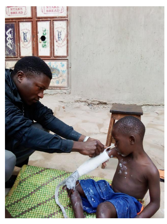
Special needs plastering program in the villages