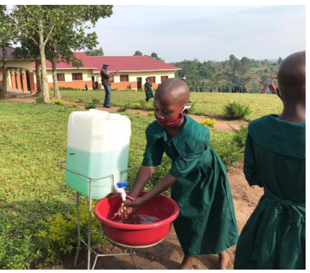
Hand washing with liquid soap in all stations