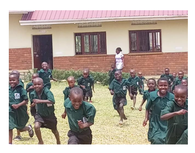
Children in Kamusenene

In the list above nursery and primary schools are only separated where they already have separate administrations. Most of our schools are registered with ministry of Education and Sports.