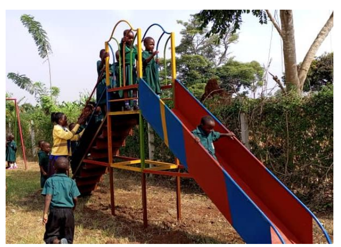
Children using the self-made slide from the welding in Nakaziba