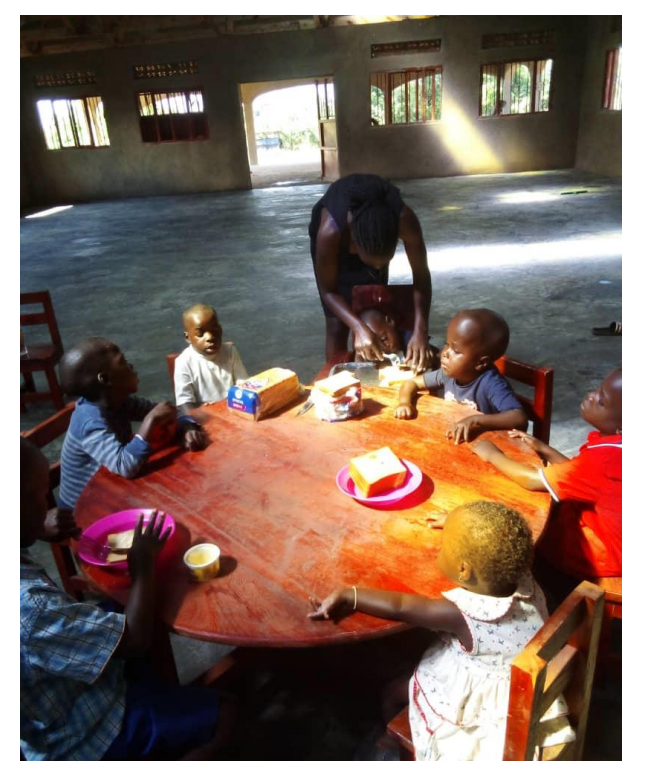
School start in the new school for special needs in Nkozi