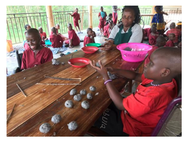
Children making eats during breakfast in CB2

Both our nurses in Busunju and Mubende division started visiting children who were sick in the field and offered them treatment services.