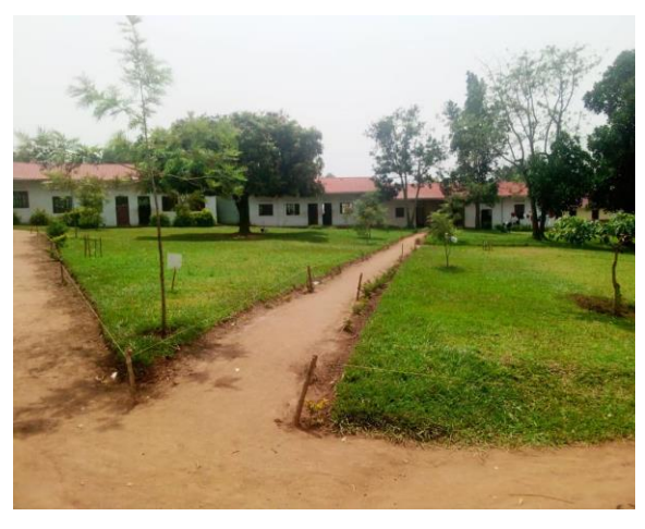
Primary School in Bongole