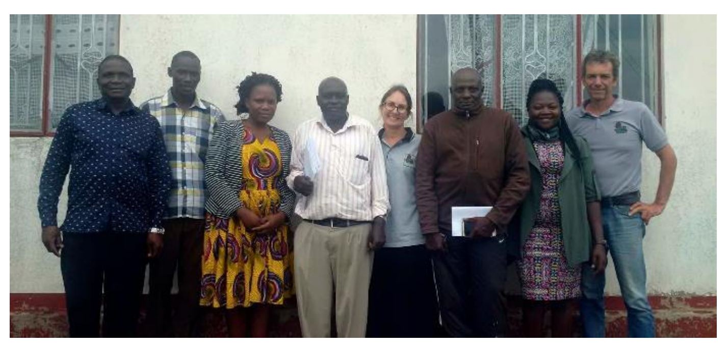
ACFC general assembly