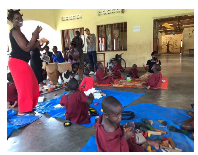
Play time in Christoph Bettermann School 2 (CB2)