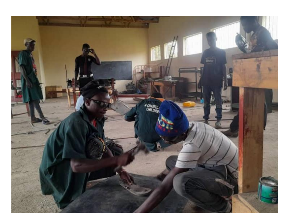
Trainees in our Welding Workshop

All these children are provided with school fees, scholastic material, school uniforms and porridge and/or lunch at school. Those in boarding houses are given additional assistance. ACFC tries to involve caretakers as much as possible and urges them to take over responsibility where possible.