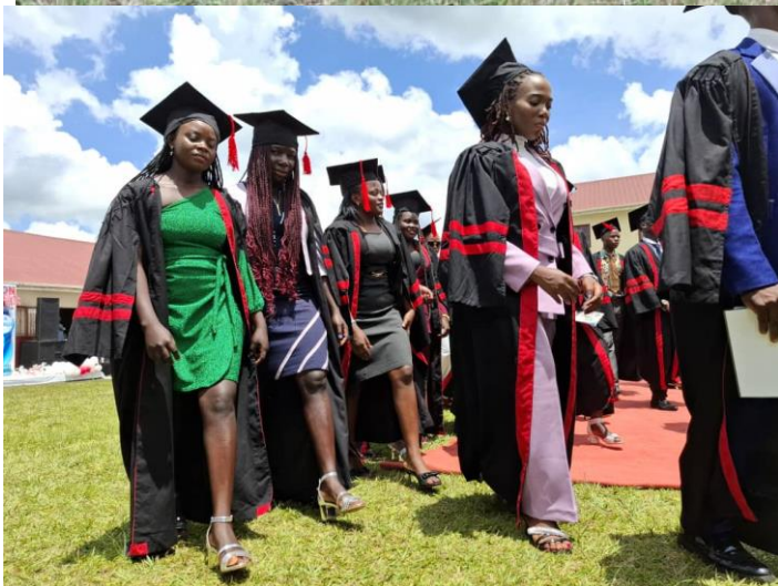
ACFC MAKING SURE THAT STUDENTS GRADUATE