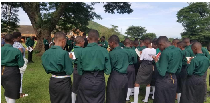
STUDENTS AT THE TOUR

✓ Both Schools have registered Centers for UCE (O level) exams. Both schools offer vocational subjects and the best students can do the UVTAB exams at the end of Senior S3.