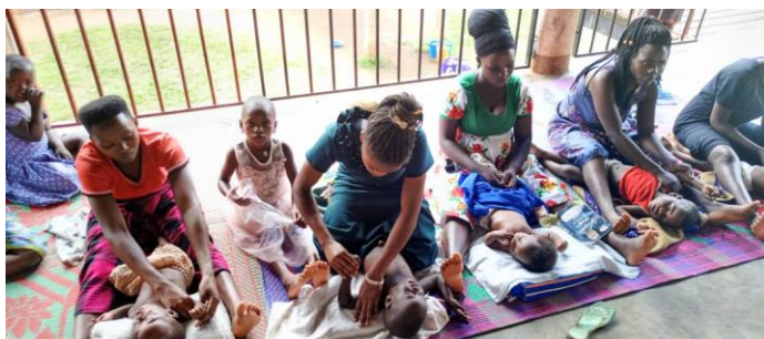
CARETAKERS AND THE CHILDREN