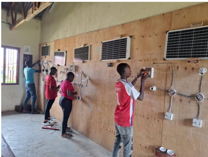
STUDENTS IN SOLAR AND ELECTRICITY