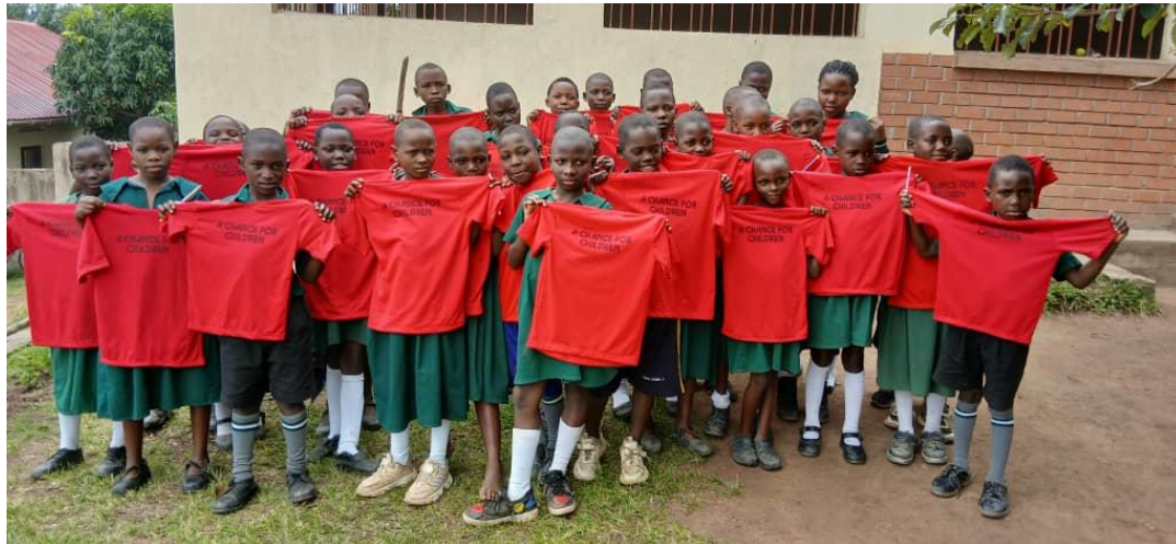
CHILDREN IN ONE OF OUR SCHOOLS WITH T. SHITRS PRODUCED BY ACFC

All these children are provided with school fees, scholastic materials, school uniforms and porridge or lunch at school. Those in boarding houses are given additional assistance. ACFC tries to involve caretakers as much as possible and urges them to take over responsibility where possible.