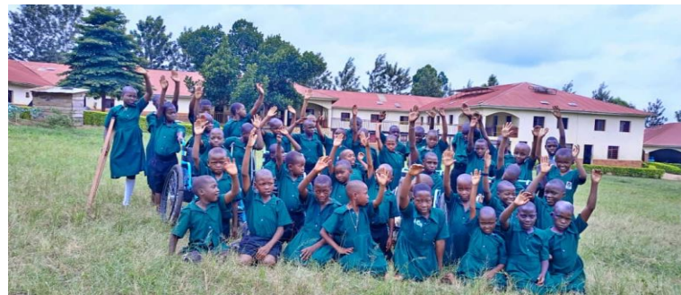
CHILDREN IN THE SPECIAL NEEDS SCHOOLS