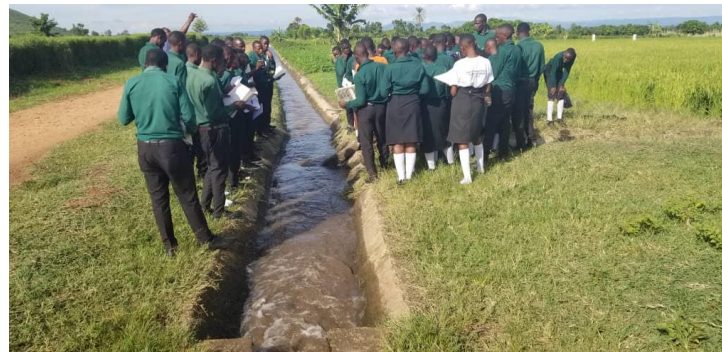
STILL STUDENTS AT THE TOUR