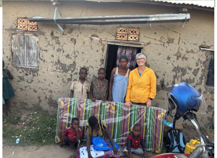
ACFC SUPPORTS VERY NEEDY FAMILIES