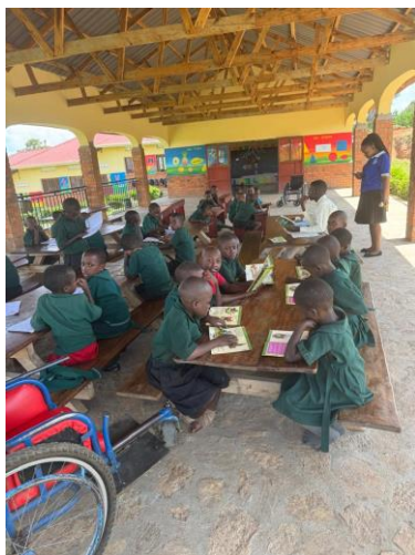
CHILDREN AT SCHOOL READING BOOKS