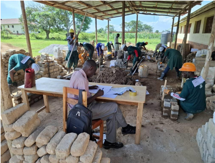
STUDENTS IN CONSTRUCTION