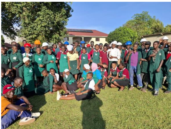
GROWN UP STUDENTS FOR VOCATIONS