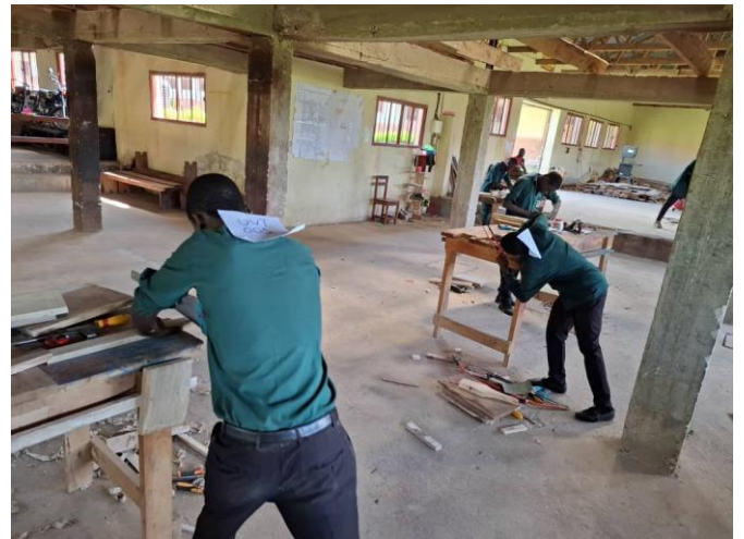
TRAINING IN CARPENTRY