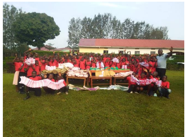
CHILDREN IN THE HOLIDAY CAMP