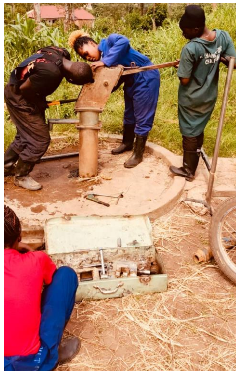
ONE OF THE REHABILITATED WATER SOURCES

The water program drills and rehabilitates boreholes in rural areas. Since the program started 81 boreholes have been drilled in different sub counties which help communities to get clean water and reduce absenteeism of learners due to carrying water long distances. All boreholes are drilled on community land and each community has to form a water committee which is responsible for care of the boreholes, reporting to our team when there are problems.