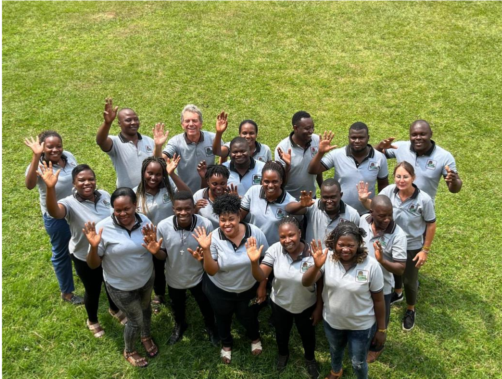
A TEAM OF SOCIAL WORKERS WITH MANAGEMENT

Social workers improve the lives of the most vulnerable children by enabling them access quality education, addressing social and interpersonal difficulties, promoting children’s rights and protecting them from harm, hence helping children improve their current conditions through learning in order to empower them live an independent life free from poverty by having a chance to be job makers than job seekers when they grow up. To fulfil this, social workers register children seeking support, carry out family visits and for any family fitting our criteria for support and recruitment of new children is done throughout the year.