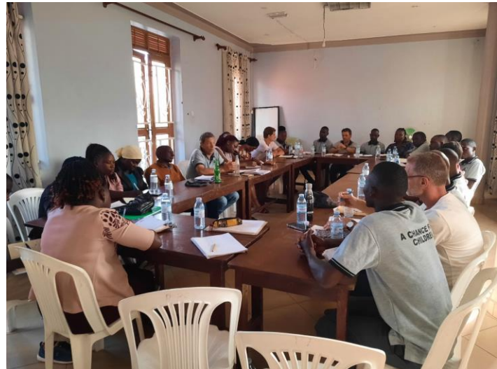
ACFC MANAGEMENT MEETING WITH AUSTRIAN BOARD

The organization has an executive and a general assembly which meets at the beginning of the year to plan how best the organization’s activities can be enhanced. ACFC is managed by staff at headquarters, headed by the coordinator who meets with the chairman to set weekly programs, works hand in hand with schools administrators and department heads to ensure effective service delivery in different sectors, various meetings are held for proper planning.