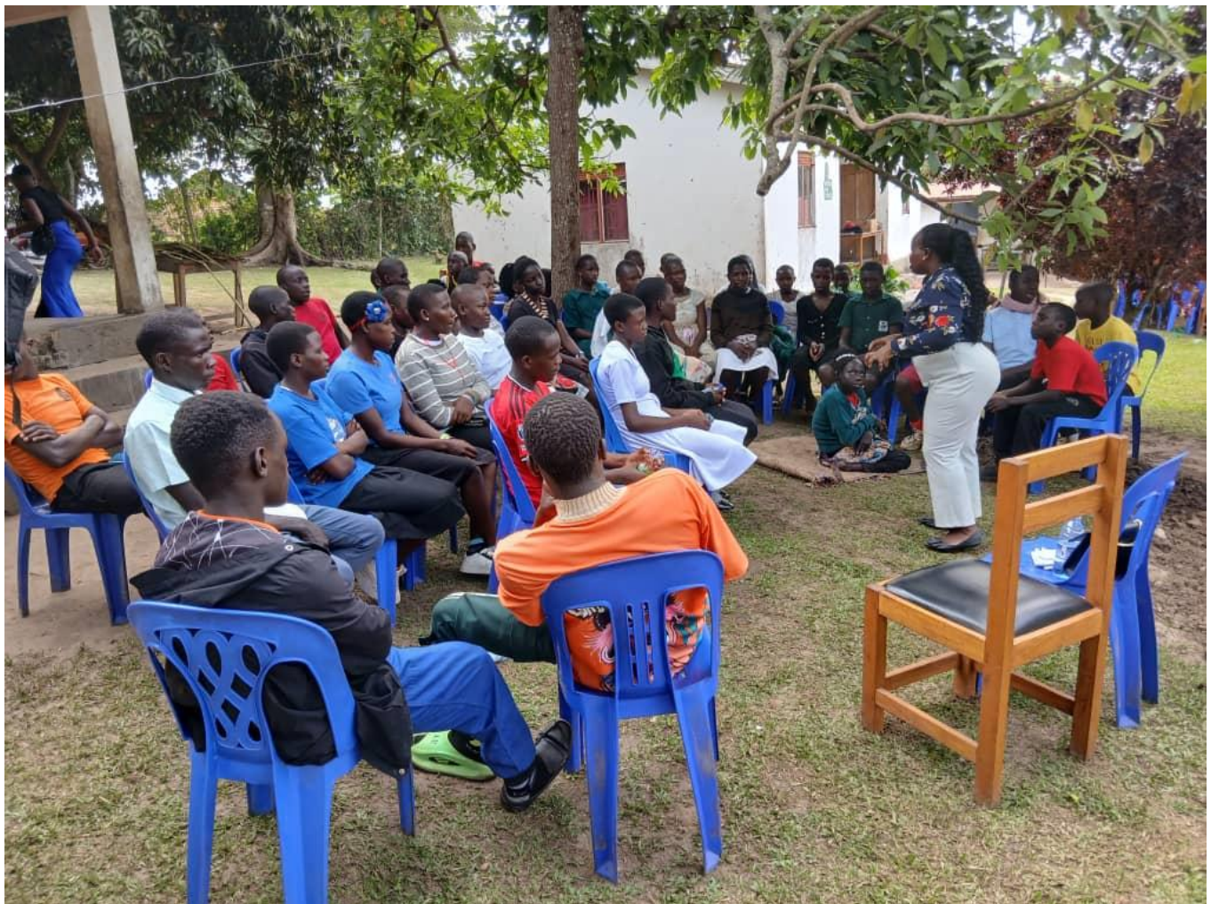
POSTIVE LIVING COUNSELLING PARTY WITH A COUNSELOR/NURSE

This program currently operates in Mityana, Mubende, Kassanda, and Mpigi districts. It caters for HIV positive living children and some positive living mothers as indicated above. Every month we provide transport to the hospital for their medicine and check up by doctors. We provide nutritious food (sugar, maize flour, beans, rice, different types of soya and bathing soap). Our social workers carry out regular visits to their homes to check on hygiene, bedding, hospital attendance and health status. In case of severe sickness, if they are admitted to hospital, we cover treatment costs. Three times a year during school holidays, we offer special counselling meetings with nurses and counselors.