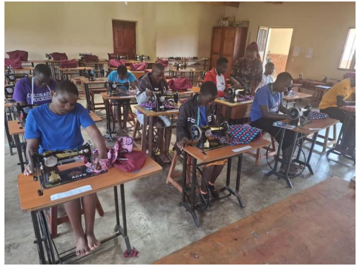
STUDENTS IN TAILORING