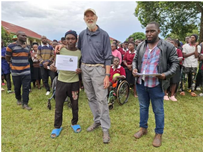
DIT STUDENTS ACQUIRING CERTIFICATES