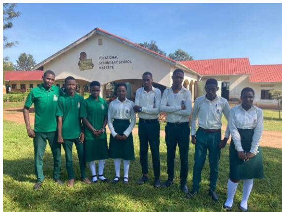
STUDENTS AT NATEETE SECONDARY. IN SECONDARY WE CATER FOR HANDICAPPED STUDENTS