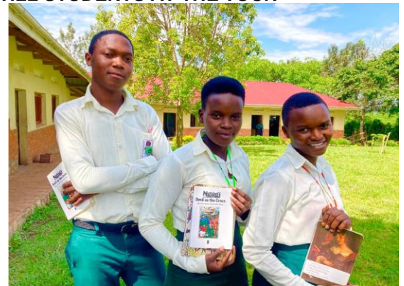
A LEVEL STUDENTS