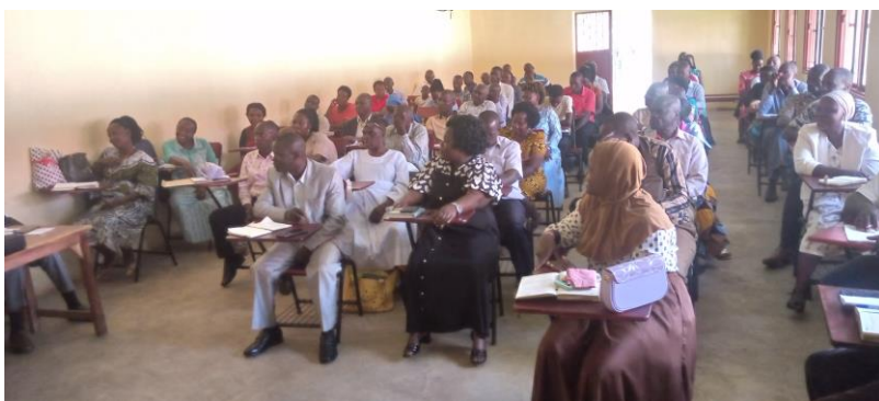
MEETING PORRIDGE PROGRAM TEACHERS