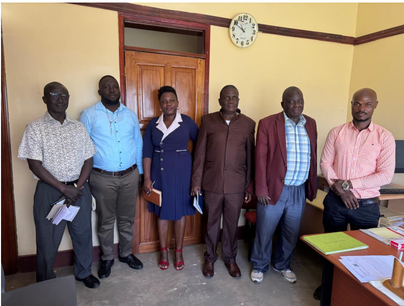
ACFC UGANDA MANAGEMENT TOGETHER WITH DISTRICT OFFICIALS