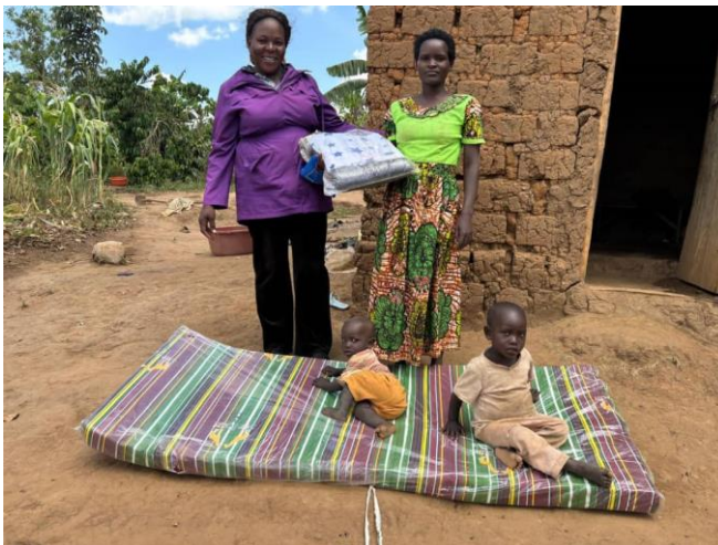
A SOCIAL WORKER GIVING OUT BEDDINGS