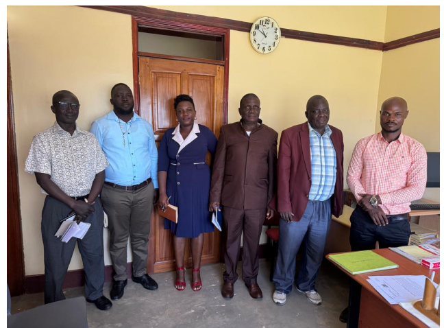
DISTRICT OFFICIALS VISITING ACFC