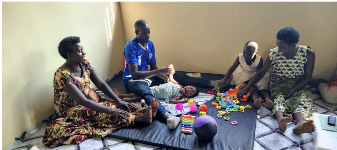
ONE OF THE THERAPISTS WORKING ON A CHILD