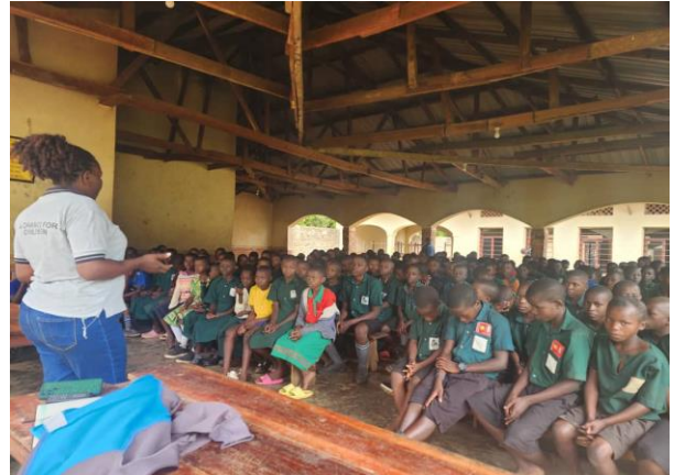
EMPHASIZING DISCIPLINE THROUGH COUNSELLING