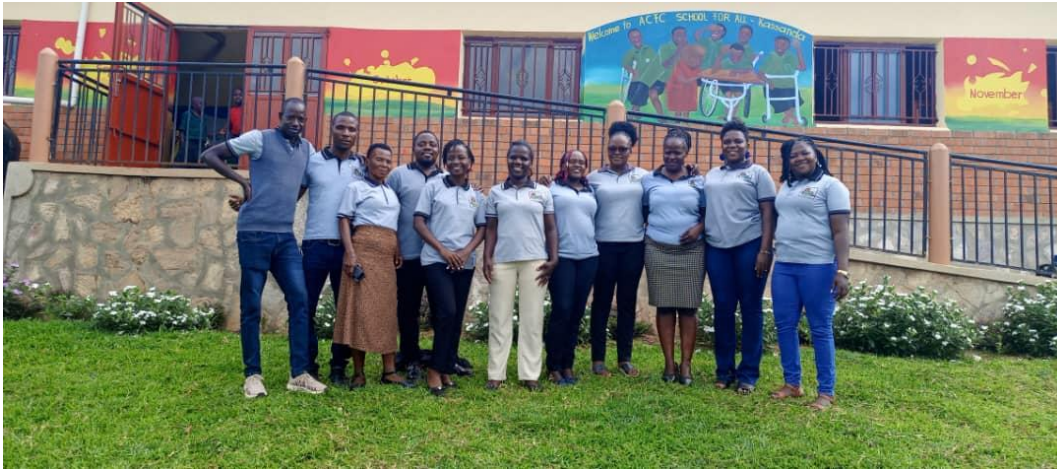
TEAM OF SPECIAL NEEDS HEAD TEACHERS TOGETHER WITH THE COORDINATOR

A CHANCE FOR CHILDREN SPECIAL NEEDS is a department of A CHANCE FOR CHILDREN that offers a variety of activities but also concentrates more on the school services. We have two stations who accommodate only those children who are physically handicapped and four stations who are inclusive and can accommodate both the physically handicapped and those who are not in order to promote inclusion. Two stations kasambya and Kakumiro were added