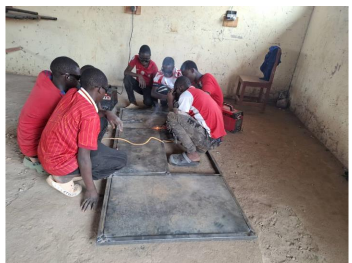
STUDENTS IN WELDING