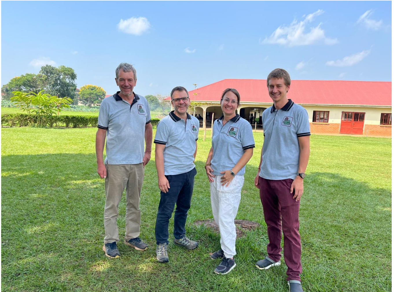
BOARD MEMBERS AUSTRIA