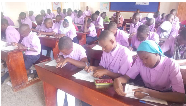
ST. KIZITO NAMIGAVU DOING BOT EXAMS

Mityana district 54 schools Mubende district 19 schools