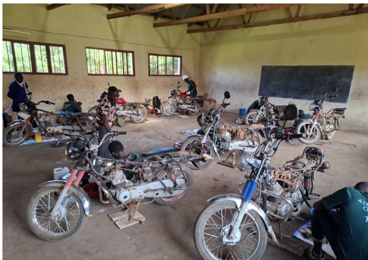
STUDENTS IN MECHANICS

A chance for Children has come up to participate in this skilling process of the young youths in Uganda. We offer 11 vocational courses that are all practical. And most of the students have been a success in the employment world. To us, every learner can be a job creator than a job seeker and can sustain him or herself in future.