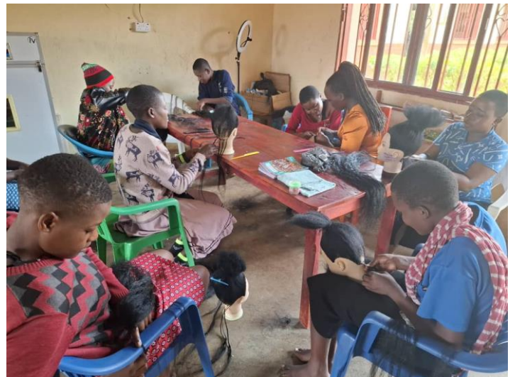
STUDENTS IN HAIRDRESSING