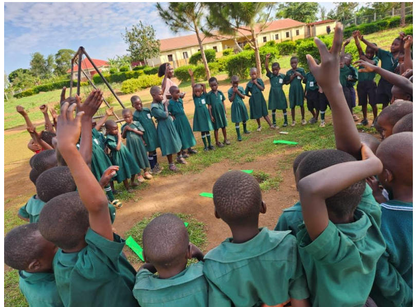
OUT DOOR ACTIVITIES