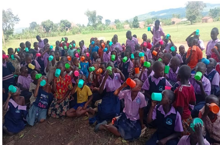
KANNYOGOGA PS TAKING PORRIDGE