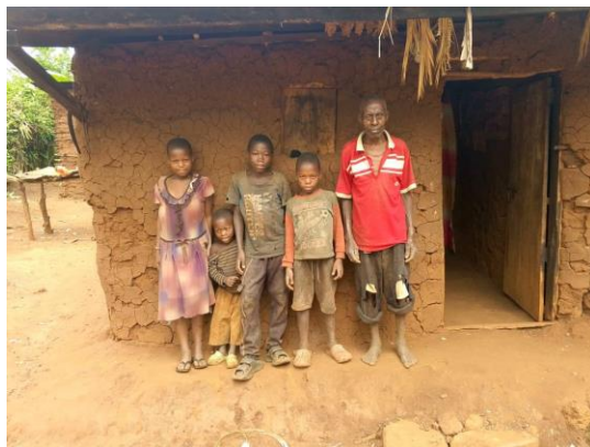
SOME OF THE FAMILIES WE SUPPORT

Our social workers register children who seek support every year and carry out family visits to their families, here they select cases that should receive support. Their findings are presented to Ugandan and Austrian management teams and together decisions about who should be supported are taken.