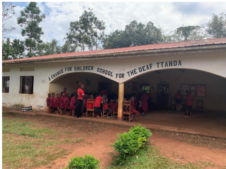
SCHOOL FOR THE DEAF TTANDA