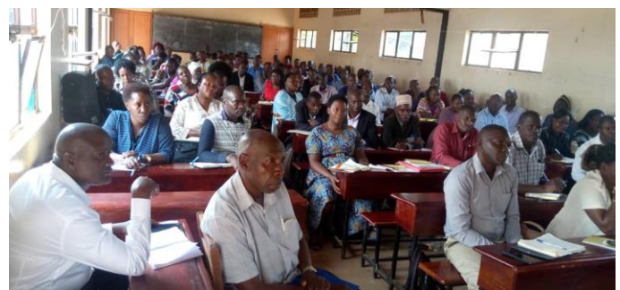
MEETING PORRIDGE PROGRAM TEACHERS