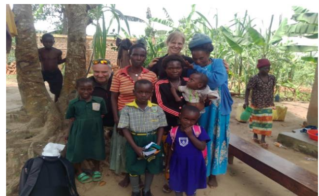
DONORS VISITING CHILDREN AT HOME