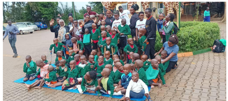
SPECIAL NEEDS CHILDREN AT THE TOUR