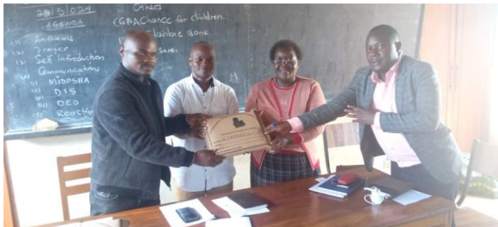
DEO RECEIVING BOT EXAMS