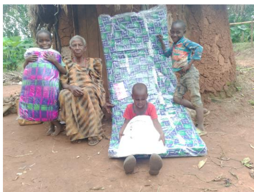
FAMILIES GETTING BEDDINGS