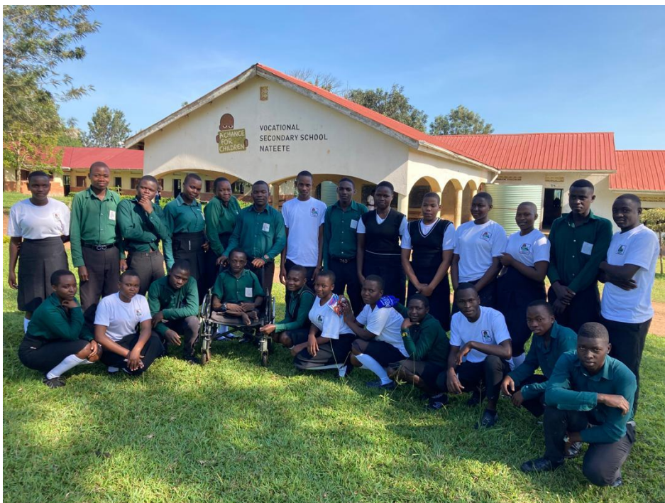
NATEETE SECONDARY SCHOOL