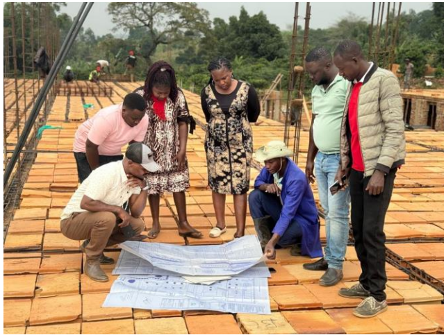
COORDINATOR WITH STAFF AT KASAMBYA CONSTRUCTION

A CHANCE FOR CHILDREN (ACFC) is a non-governmental organization based in Zigoti, 53 kilometers from Kampala. We are operating in 6 districts i.e. Mityana, Kasanda, Mubende, Mpigi, Gomba and Kakumiro districts for the past 17 years