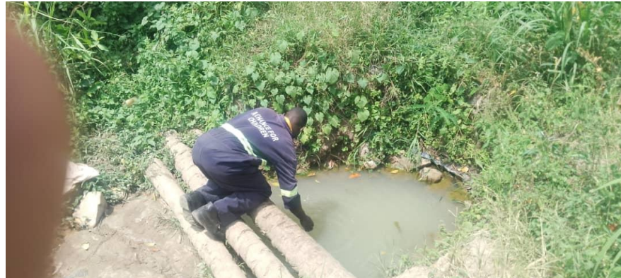
ONE OF THE PROPOSED WATER SOURCES

The water program drills and rehabilitates boreholes in rural areas. Since the program started 80 boreholes have been drilled in different sub counties which help communities to get clean water and reduce absenteeism of learners due to carrying water long distances. All boreholes are drilled on community land and each community has to form a water committee which is responsible for care of the boreholes, reporting to our team when there are problems.