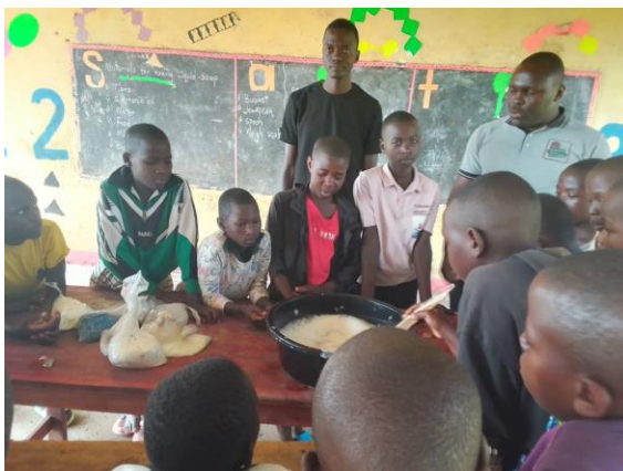
CHILDREN IN THE HOLIDAY CAMP