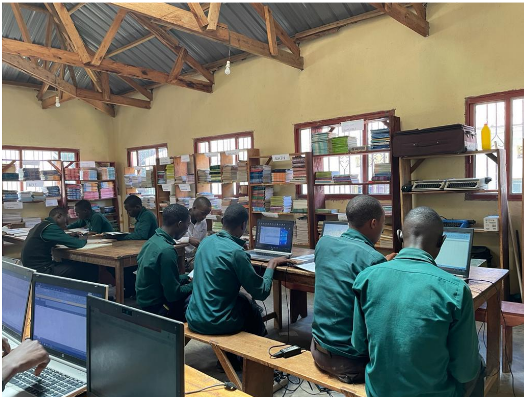
STUDENTS IN COMPUTER ROOM