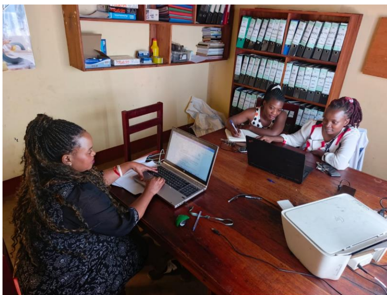
SECRETARIES AND ACCOUNTANT OF THE HEADQUARTER ZIGOTI

All employees are registered for NSSF and pay as you earn is also paid. Staff are provided with accommodation when needed and food during working hours.