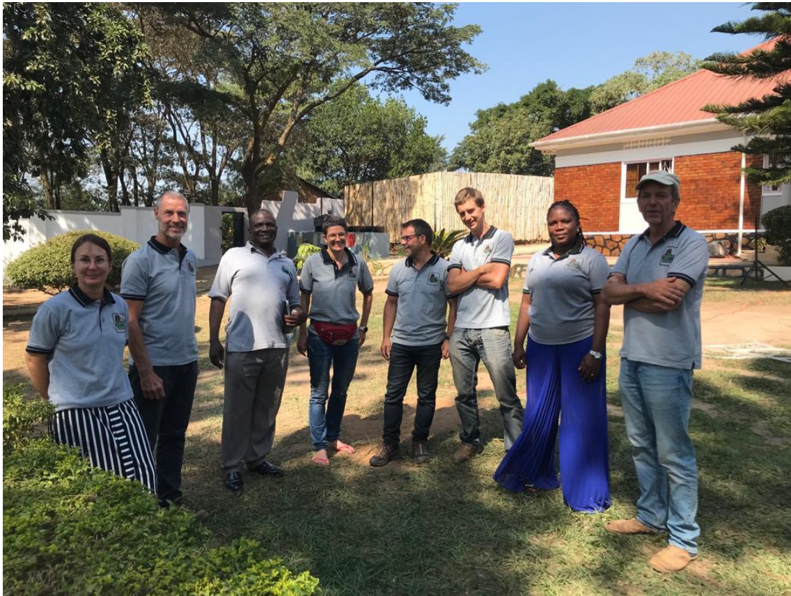
DEVELOPMENT PARTNERS WITH THE MANAGEMENT IN UGANDA